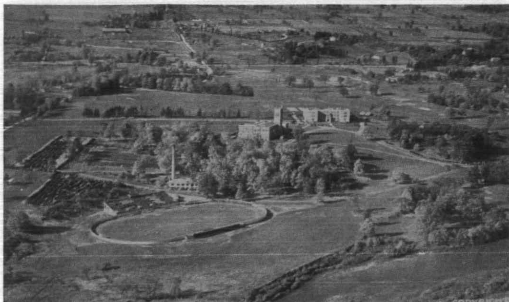
AIRVIEW OF CAMPUS, UNIVERSITY OF WESTERN ONTARIO, LONDON, ONTARIO

and provides facilities for the playing of intercollegiate rugby. To provide easy access to the grounds, the University built its own bridge over the Thames River and secured the right of way to the bridge-head on the city side.