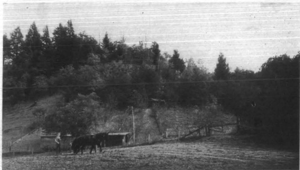
HIGH SCHOOL BOY

he would just have to count it up for me. I said, "Isn't it wonderful to have such a book-keeper" and my generous customer said, "What about the customers?" and I said, "Oh, I'll tell you that when you have begun." Imagine my telling them to please step out in the lobby while I wrapped up the packages (my shop is too small for my stock and customers at the same time). I dug the Guest Book out of a corner, for I haven't a place to put it, and asked them to write their names in it. You know men don't fuss around like