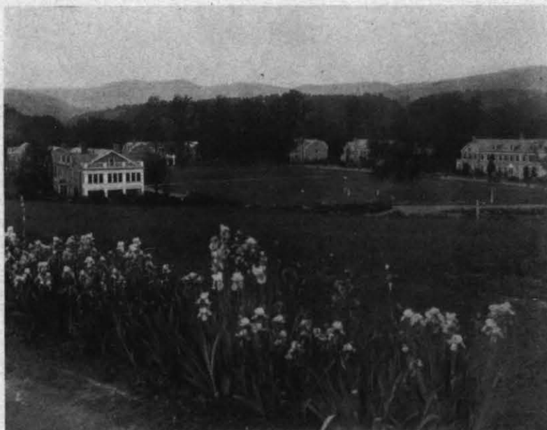
FEDERAL INDUSTRIAL INSTITUTION FOR WOMEN ANDERSON, WEST VIRGINIA

There she has remained until the present time, carrying out her unusual ideas for the treatment of women prisoners with distinguished success.