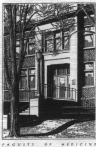
FACULTY OF MEDICINE