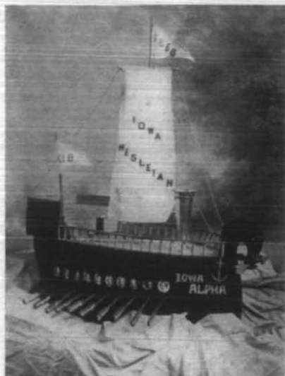
IOWA ALPHA CHAPTER EXHIBIT