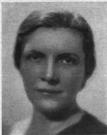
DR. GLADYS DICK

S UCH is the work of Gladys Henry Dick, Nebraska B, and her husband, also a doctor, George F. Dick. For years they have devoted their lives to the study of the causes, prevention and cure of scarlet fever, and their