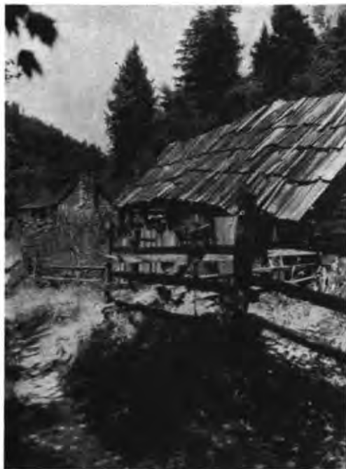
A TYPICAL COTTAGE—HAND-HEWN SHINGLES

The first issue of the Arrow News for this year appeared on the newsstands last week. The paper is bigger, and better than