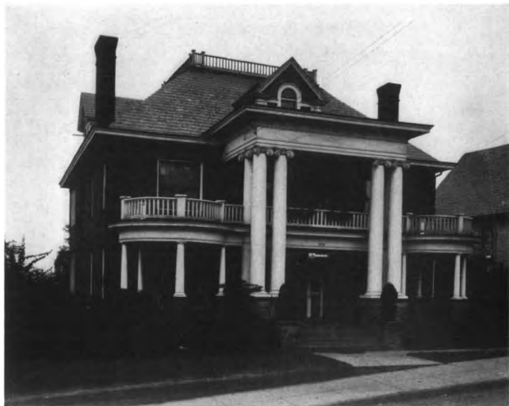
WEST VIRGINIA ALPHA REJOICES IN A NEW HOME OF ITS OWN, PURCHASED LAST YEAR