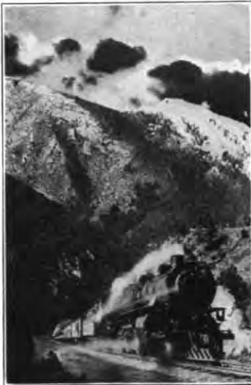
28 RANGES OF MOUNTAINS ON THE NORTHERN PACIFIC

There will be special \Pi B \Phi Pullmans returning through the Northwest, after Pasadena; the Northern Pacific is arranging: