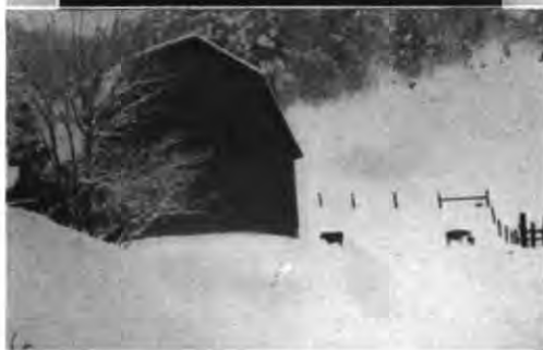
WINTER COMES TO GATLINBURG

School, announces a course in wood and metal craftsmanship for adults. There will be classes in the afternoons for all adults who would either like to know more about the work or get a start in wood and metal artcraft.