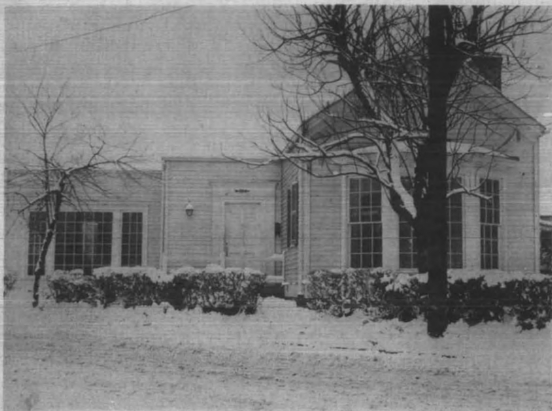
WINTER IN THE NEW KENTUCKY ALPHA HOME