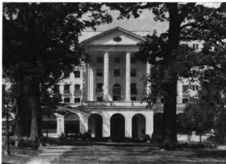
THE PORTICO AT THE GREENBRIER