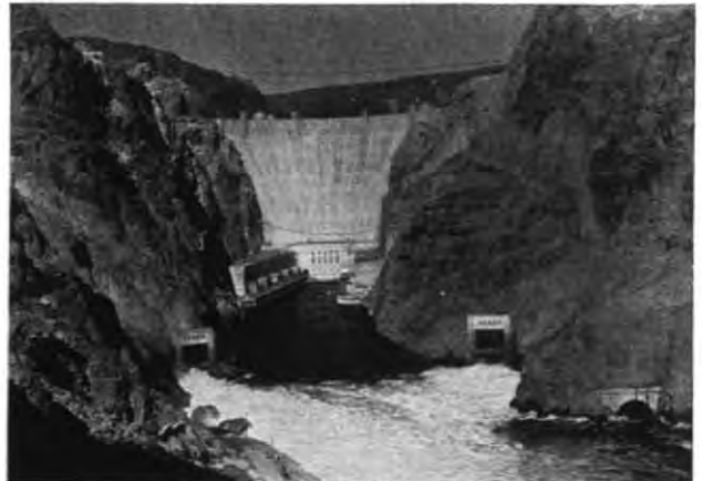
DOWN STREAM VIEW, BOULDER DAM

Early next morning the train pulls into beautiful Salt Lake City, the imposing and distinctive capital of Utah. Coming into this historically famous city we get a grand view of the Mormon Temple, with its beautiful spires, towering majestically above everything else. After a brief stop, we're on our way again, and soon the Great Salt Lake