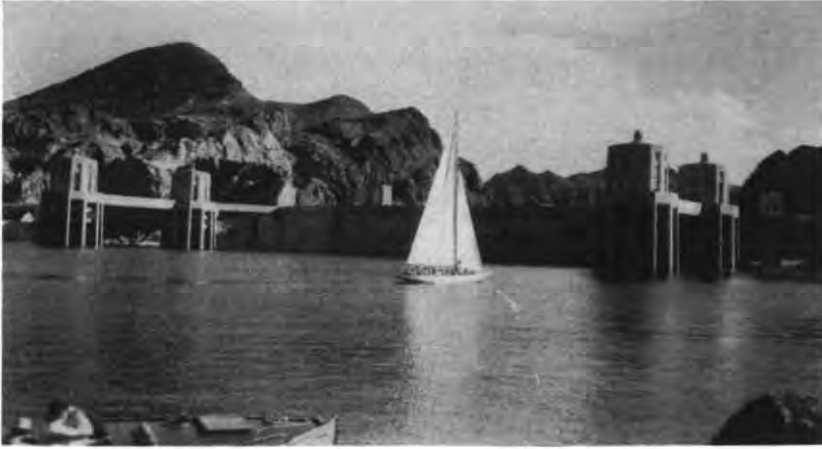
BOATING, LAKE MEAD, BOULDER DAM