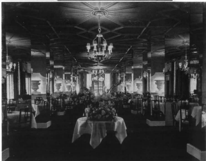
THE MAIN DINING ROOM . . . of the Roney Plaza Hotel is noted for its elegant interior, world-famous cuisine and excellent service. An excellent choice for convention meetings, dinners, buffets and formal banquets.