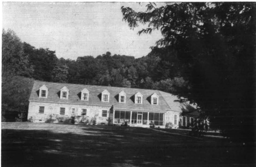
New Staff House