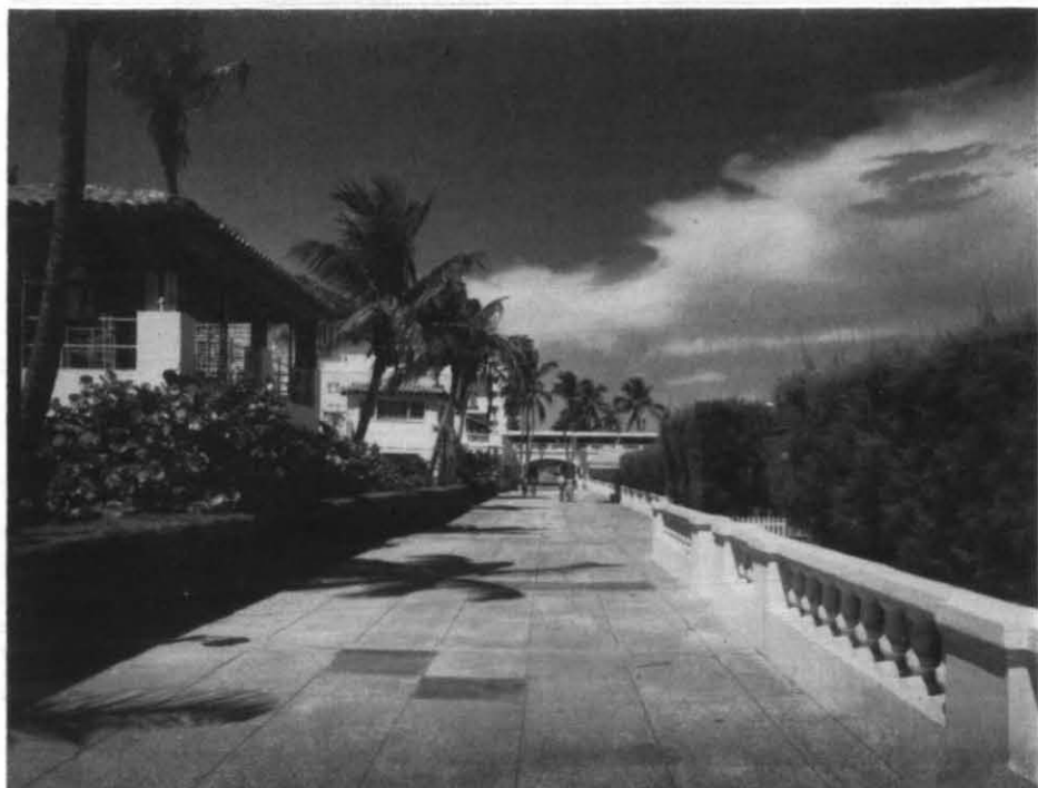
BEACH PROMENADE AT THE RONEY PLAZA

ARISTOCRAT OF WORLD RESORT HOTELS—THE RONEY PLAZA . . . and, yet, the Roney Plaza is more than a hotel. Here, in six spacious acres, there is every requisite for a luxurious existence: sumptuous Tropical Gardens illuminated by sparkling fountains, languid, palm-fringed pools and promenades that wind through colorful vistas of exotic plants and flowers . . . the famous Cabana Sun Club with its 600-ft. expanse of private beach . . . the Pool Deck scene of the Equacades.