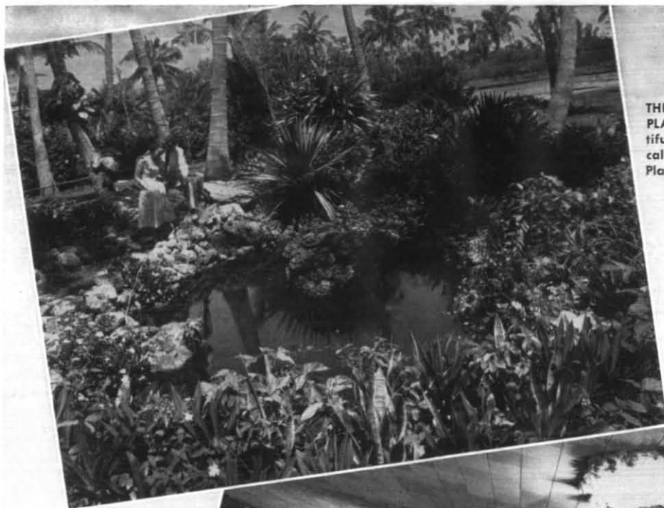
THE GLADE POOL AT THE RONEY PLAZA . . . One of the many beautiful aspects of the six-acre Tropical Garden for which the Roney Plaza is renowned.