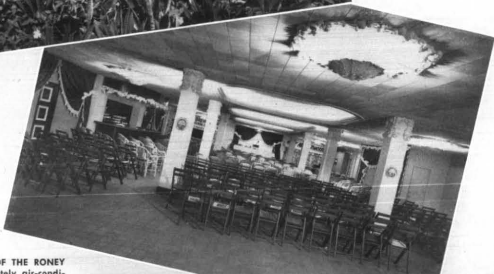
THE SURF ROOM OF THE RONEY PLAZA . . . Completely air-conditioned and furnished in exquisite good taste, this spacious room has been designed for large meetings, forums, night-club entertainment, etc.