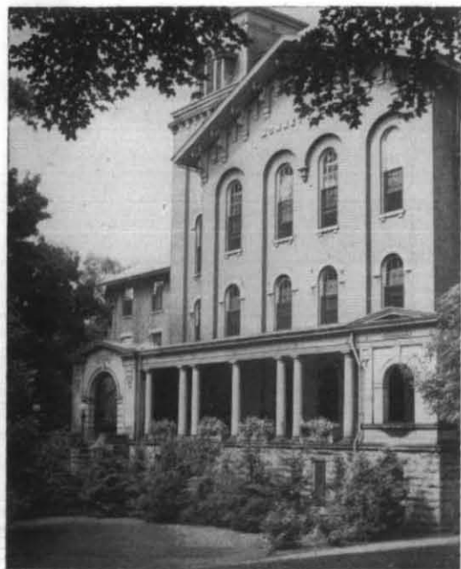
→ ALMOST every Pi Beta Phi who has attended Ohio Wesleyan University at Delaware, Ohio, has lived in Monnett Hall, shown above,