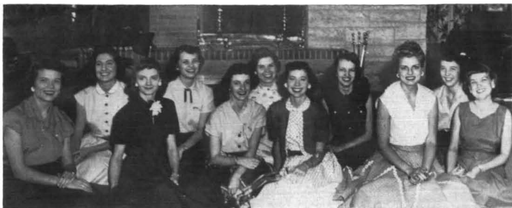
TEXAS GAMMA CHARTER MEMBERS AT THE INSTALLATION

composite of ideas taken from the concepts of the Pueblo and Navajo Indians. Each year the club has gone as a group to Santa Fe, New Mexico, at Easter Time, climaxing the five day trip with initiation in an Indian kiva near Glorieta, New Mexico, Easter Night. Ko Shari has had a well-rounded club program of social and philanthropic activities, leadership in activities on the campus and a high scholarship standard. Each year the club has contributed financially to the Southwest Collection of literature and artifacts at Texas Technological College, worked in all drives for community projects, given Christmas parties for Milam's Orphanage and taken the lead in aiding the college in its programs. The year 1951-52 Ko Shari won all