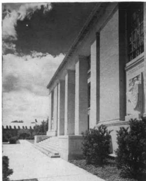
FRED LEWIS PATTEE LIBRARY on the campus of The Pennsylvania State University was constructed in 1938 and its size was doubled with an addition completed in 1953. It provides facilities for the main collection while branch libraries or reading rooms are located in several of the undergraduate colleges of the University.

It has long been a fine fraternity school and while its name may be officially changed, it will continue to be "Penn State" for many people who have dealt with it through the years.