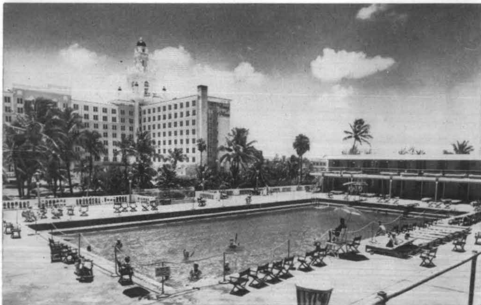
HOTEL POOL AND PLAZA