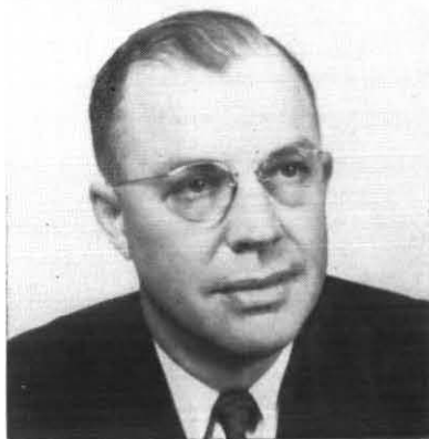
PRESIDENT of The Pennsylvania State University is Dr. Milton S. Eisenhower, one of the leading educators of the Nation, who came to Penn State in 1950 after serving for seven years as president of his Alma Mater, Kansas State College.

On Friday afternoon, November 13, forty-one girls were pledged to Pi Beta Phi. The evening was devoted to the reading of the Constitution followed by the first truly Pi Phi experience the girls had ever shared—a cooky-shine with all the gayness and relaxation that wonderful event affords.