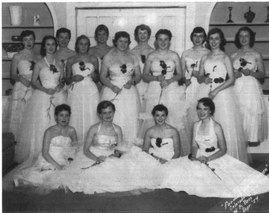
NEW \Pi \beta \Phi INITIATES