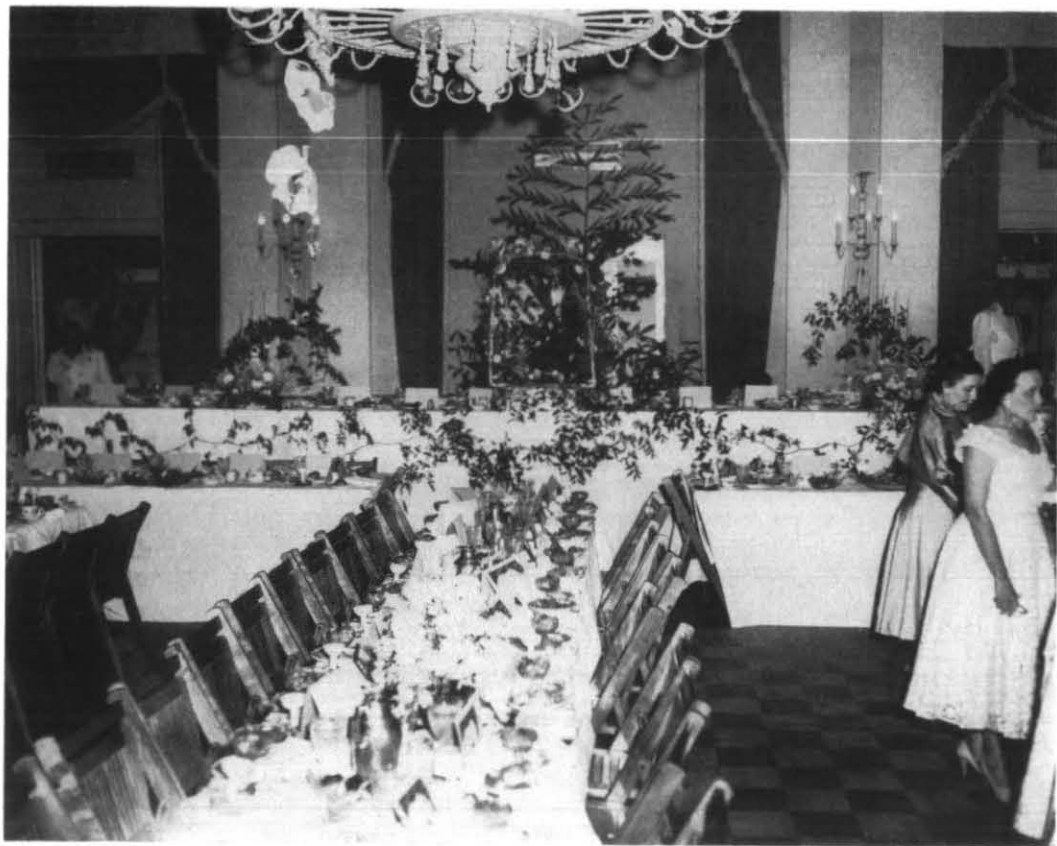
THE BANQUET DECORATIONS LOOKED LIKE THIS . . .