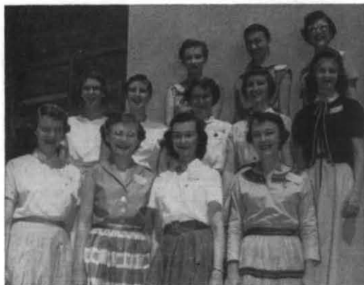
These Pi Phi's took a short time out from meetings to have their picture taken at the Western Regional Convention of Intercollegiate Association of Women Students in Tucson, Arizona, April 7-11.