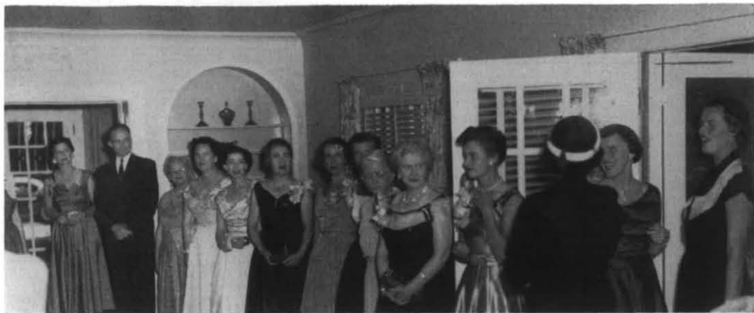
RECEPTION FOR GUESTS, PARENTS, FACULTY AND ALUMNÆ

bers last year—and this year they have pledged 28 of the finest girls on the campus. The girls are active on campus, with seven members of Spurs, one of them the president; and members