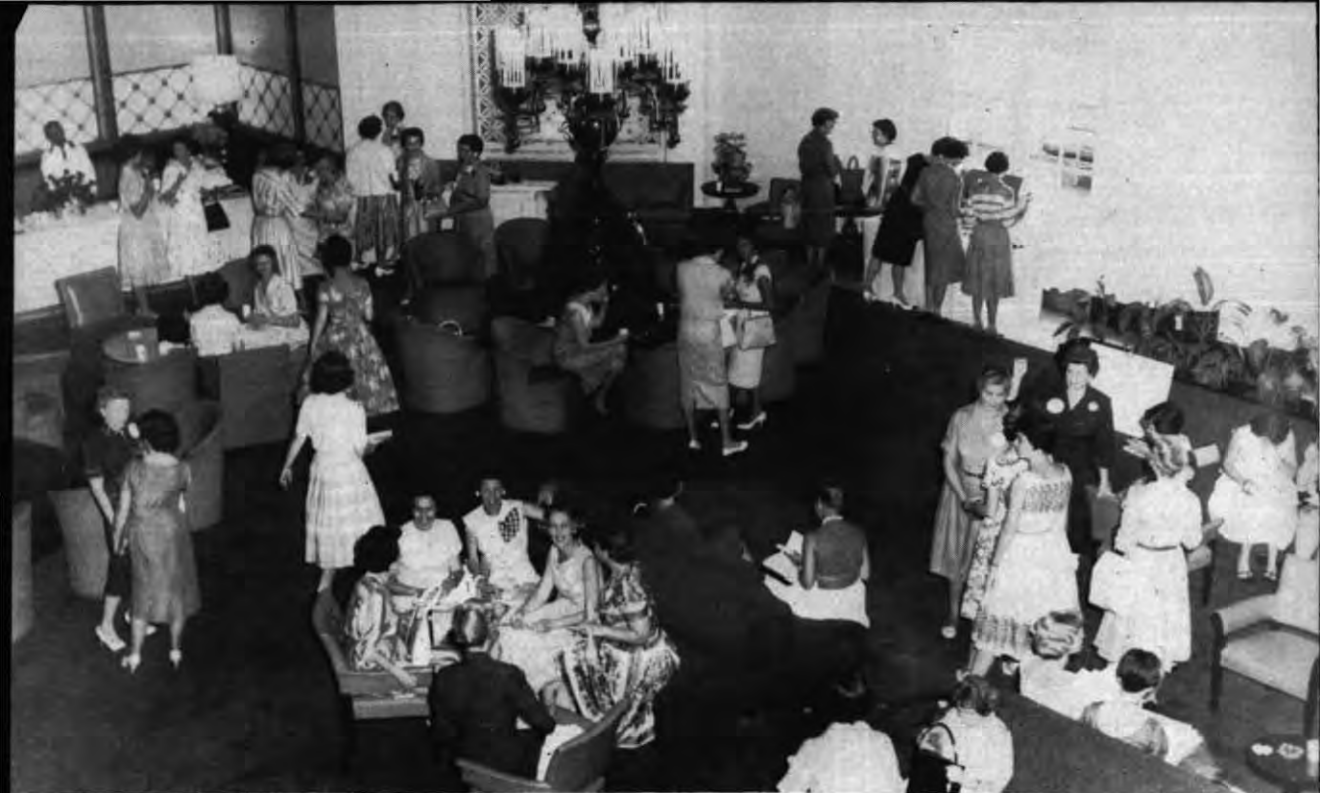
Convention opens on a happy, friendly note at the Informal Coffee in the Arlington Lobby.