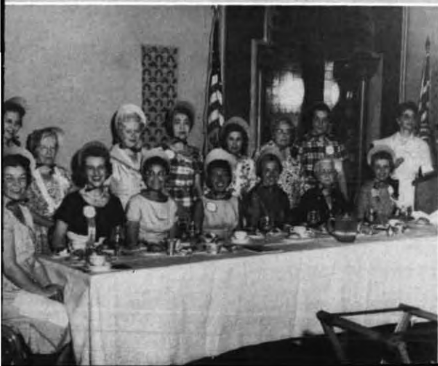
Top left: Pi Province Actives in a happy mood.