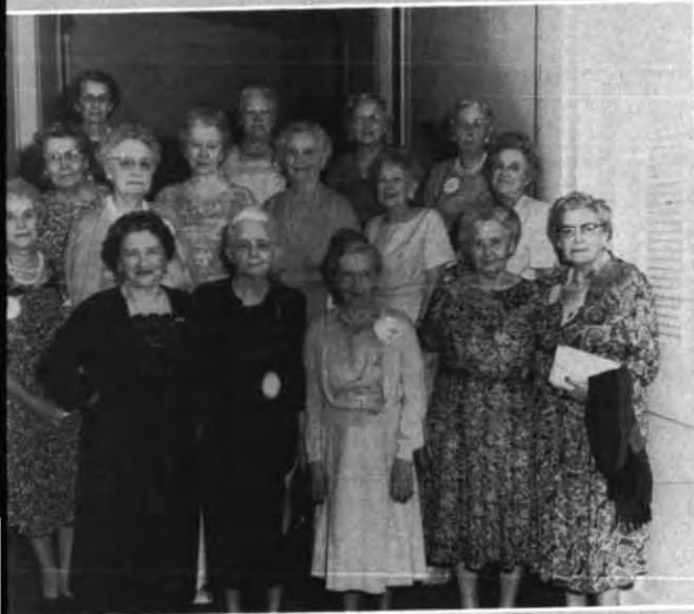
GOLDEN ARROW P.I. PHIS WHO ATTENDED CONVENTION