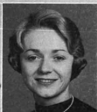
Precious Park Okla. A