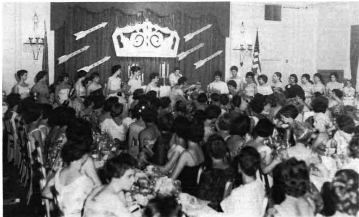
All eyes are on the 1960 Awards Winners.

The main theme was emphasized again in the