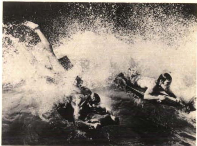
Surfing in the desert? Big Surf is Arizona's ocean in the desert and it is the highlight of Tour #3.