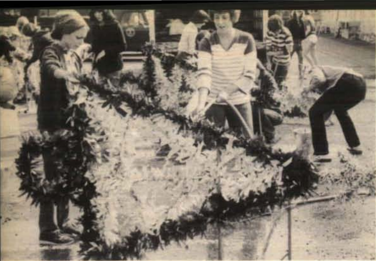
Pennsylvania Gammas hose down dirty Christmas ornaments for the city of Carlisle.