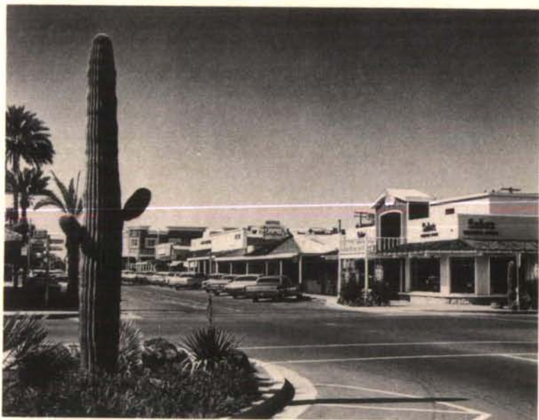
Downtown Scottsdale features some unique shops and recreation afternoon Tour #1 will include browsing time in this interesting little city.