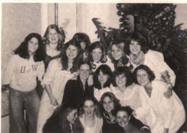
Washington Alpha Pi Phis and their new little sisters are "caught" in front of the Christmas tree during their traditional Christmas party last winter. Pictured are "the girls from 3 back."