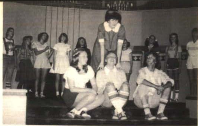
1978 has been a winning season for Michigan Delta at Albion College. Last spring they won Sigma Chi Derby Day and last fall placed third in Homecoming decorations and raised $400 by sponsoring a TV raffle. This was topped off by winning over-all competition in Sorority Songfest over five other sororities. Pictured is their You're a Good Man Charlie Brown skit.

A blue and white cake with the Pi Phi emblem was served with coffee and tea.