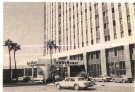
Our Convention hotel—Del Webb's TowneHouse.