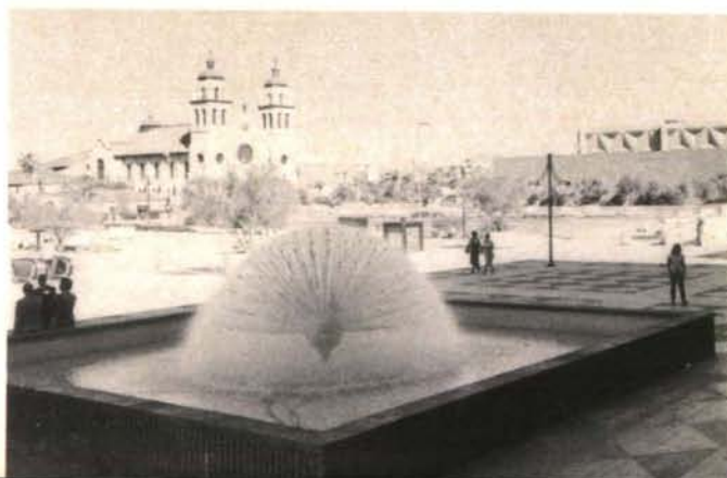
Civic Center Plaza with a view of St. Mary's Church.