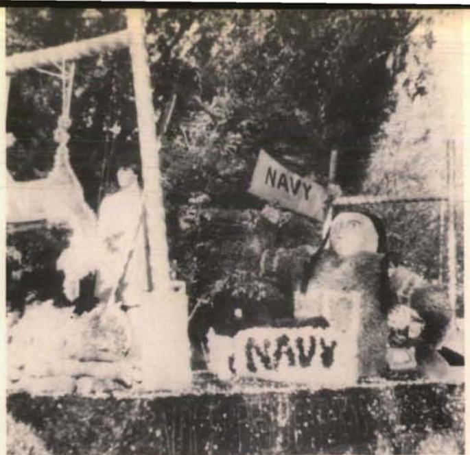
"Seminole Pride Turns The Tide" was the theme depicted by the Florida Beta—Sigma Nu float at Florida State's homecoming. The float won the best theme award.

This year Pennsylvania Epsilon joined Tau Kappa Epsilon for the homecoming activities. Finishing a strong overall fourth, they were pleased to earn first place in the window competition with the theme, "We Are Penn State—The Wild Life."