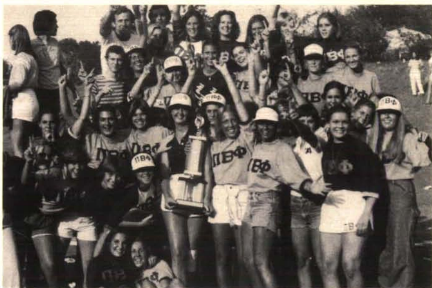
On September 29, Texas Deltas won the crazy races sorority competition of Phi Kap Man Day. Sponsored by Phi Kappa Sigma fraternity, the day included sack races, a haystack search, Gravy Train slide, and a greek goddess contest. Once again Texas Deltas took home the trophy and proved that Pi Phis are NUMBER 1!!