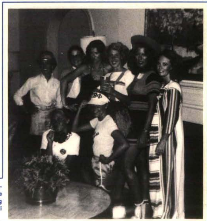
Nearly all sororities boast of the fact that individuality is a keynote of their make-up. Iowa Gamma chose to portray that individuality during rush week at Iowa State as they presented "Pi Phi Zoo."