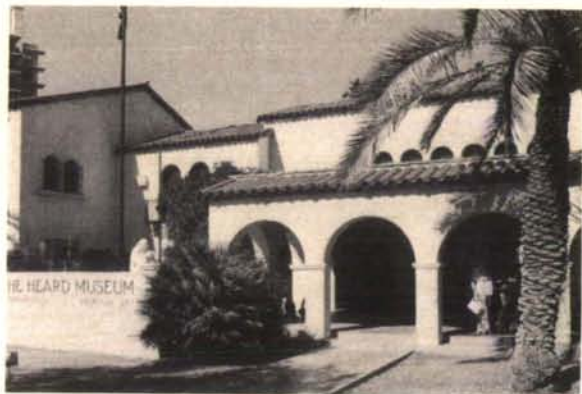
The Heard Museum will be one of the interesting visits on Tour #2 on recreation afternoon.