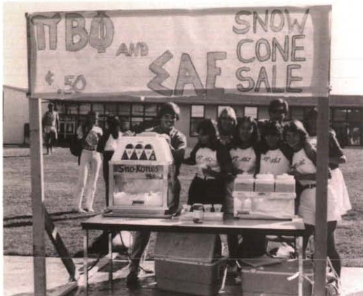
California Epsilons and SAE worked hard during Greek Week 1982 to raise money for the American Diabetes Association. Pi Phis welcomed alumnae from all over San Diego County to the All-Greek Gathering for Homecoming weekend at San Diego State.