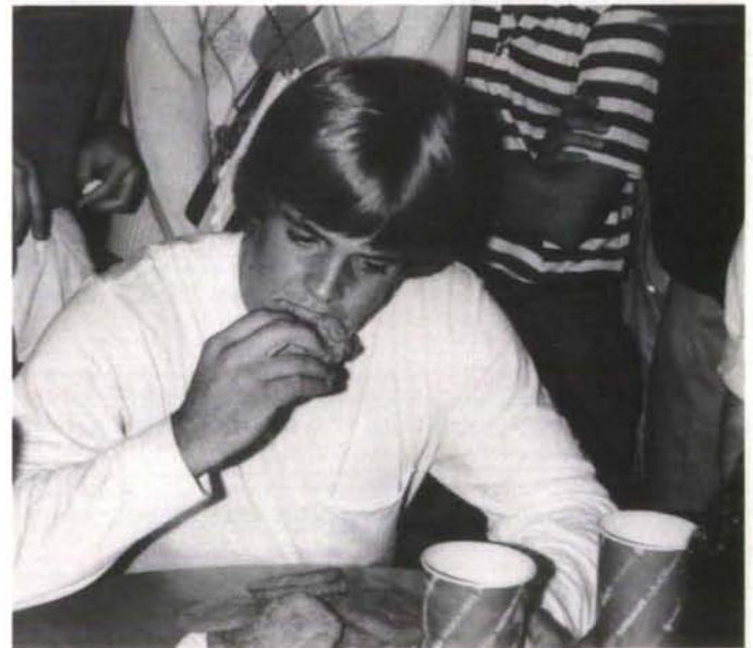
A Sigma Chi tries desperately to shovel in those cookies for the Pi Phi's money maker. The Cookie-a-Thon was sponsored by Michigan Alpha at Hillsdale College and the contest raised $160 for Arrowmont.

The event was a total success, for $160 was raised for the national philanthropy.