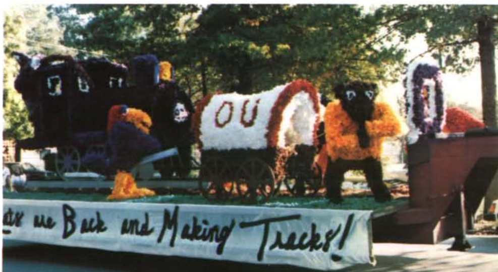
Kansas Beta Pi Phis and the SAEs took first place in the non-moving float competition during Homecoming at Kansas State.