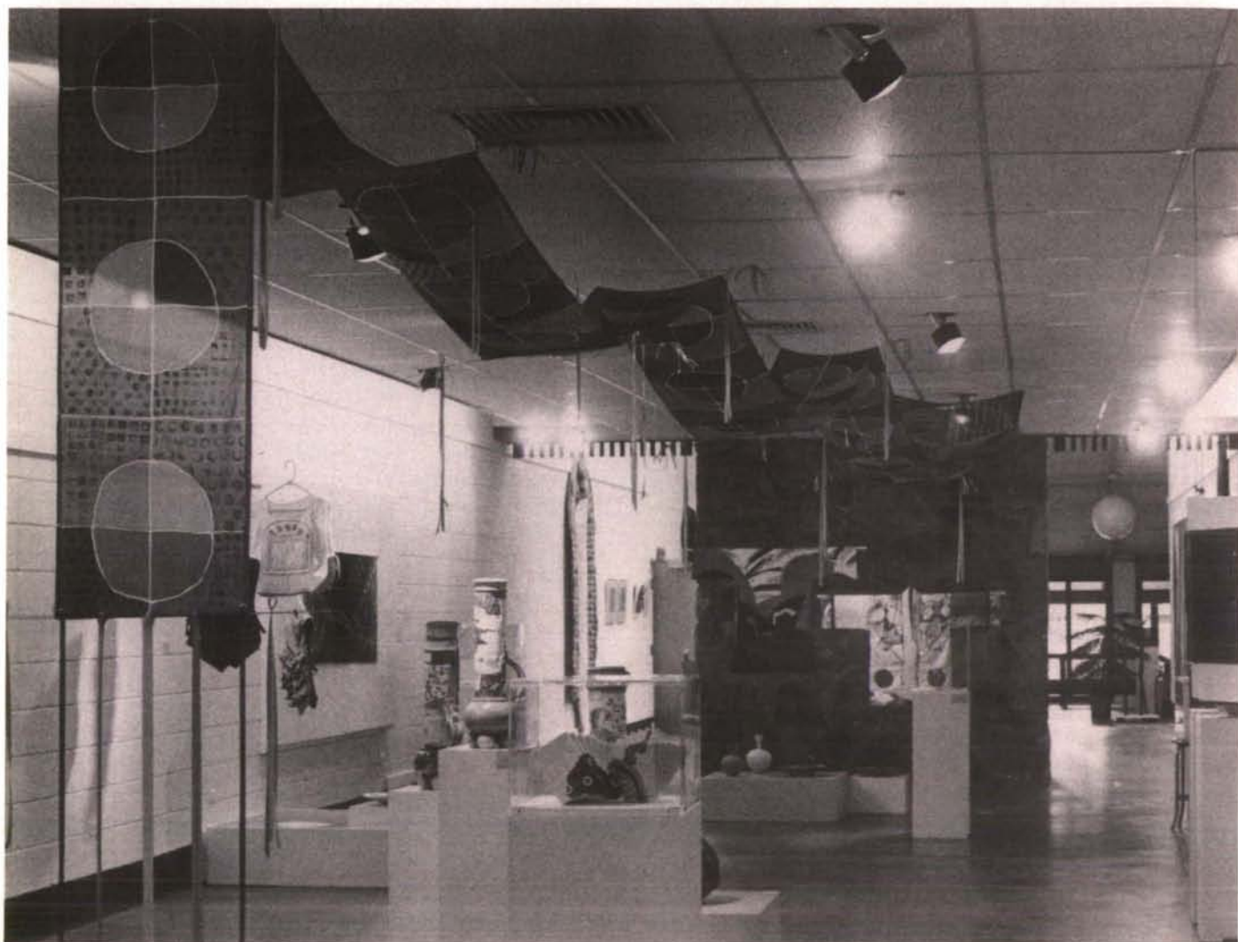
A multi-media faculty and staff exhibition was held in the Arrowmont Gallery during summer workshops.