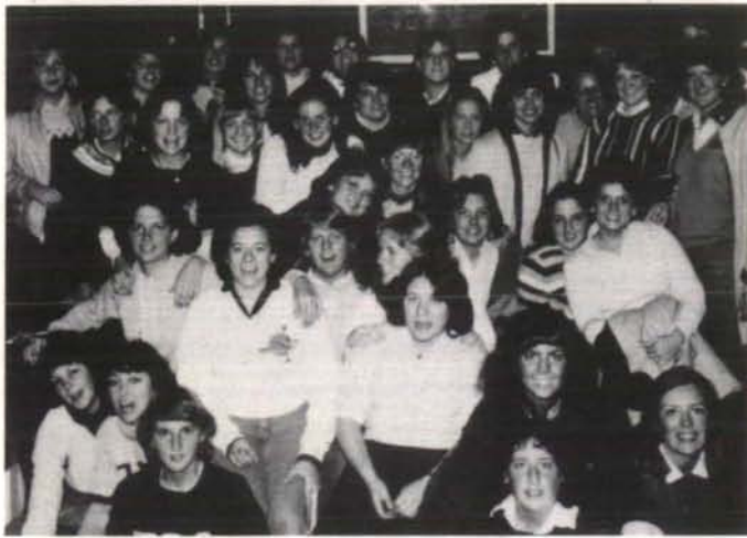
Florida Epsilon and Kentucky Alpha Pi Phis met, quite by accident, in Gatlinburg this year and enjoyed getting to know one another at the Staff House at Arrowmont.