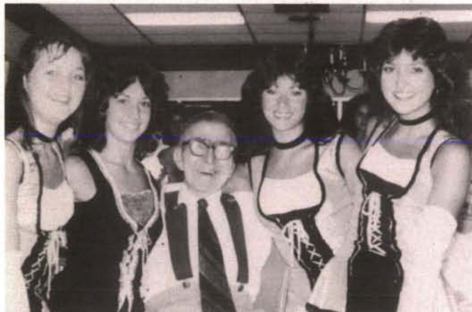
Pi Phi members of the Dixie Darling dance team at the University of Southern Mississippi entertained patients during one of the monthly visits Mississippi Alphas make to the Conva-Rest Nursing Home in Hattiesburg. At least one gentleman enjoyed the activity!

TEXAS EPSILON (North Texas State) Pi Phis helped the Denton State School with its Halloween carnival and also volunteered to wrap Christmas packages for the children. They gave blood at the annual blood drive and participated in the N.T. Health Fair. Two can drives were held with proceeds going to the needy children and battered women's homes. A number of Pi Phis participated in the first North Texas Phonathon. They also went caroling to nursing homes during the Christmas season.