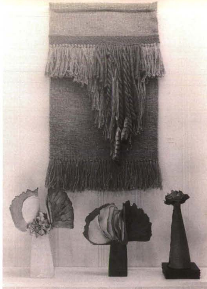
Objects on display in the Arrowcraft Shop during the Southeast Regional Assembly of the American Crafts Council included the hanging "Feather Fall" of beige/natural colored wools and feathers; and the sculptures "Sporophore," stoneware/porcelain; "Sporophyll," stoneware/porcelain/walnut; and "Ruffled sculpture," stoneware.

The exhibition was conceived to promote a specific connection, that of business, the public, artists, and fabric. Surface design will have a broader exhibition definition in the future as media crossovers and adaptations take place.