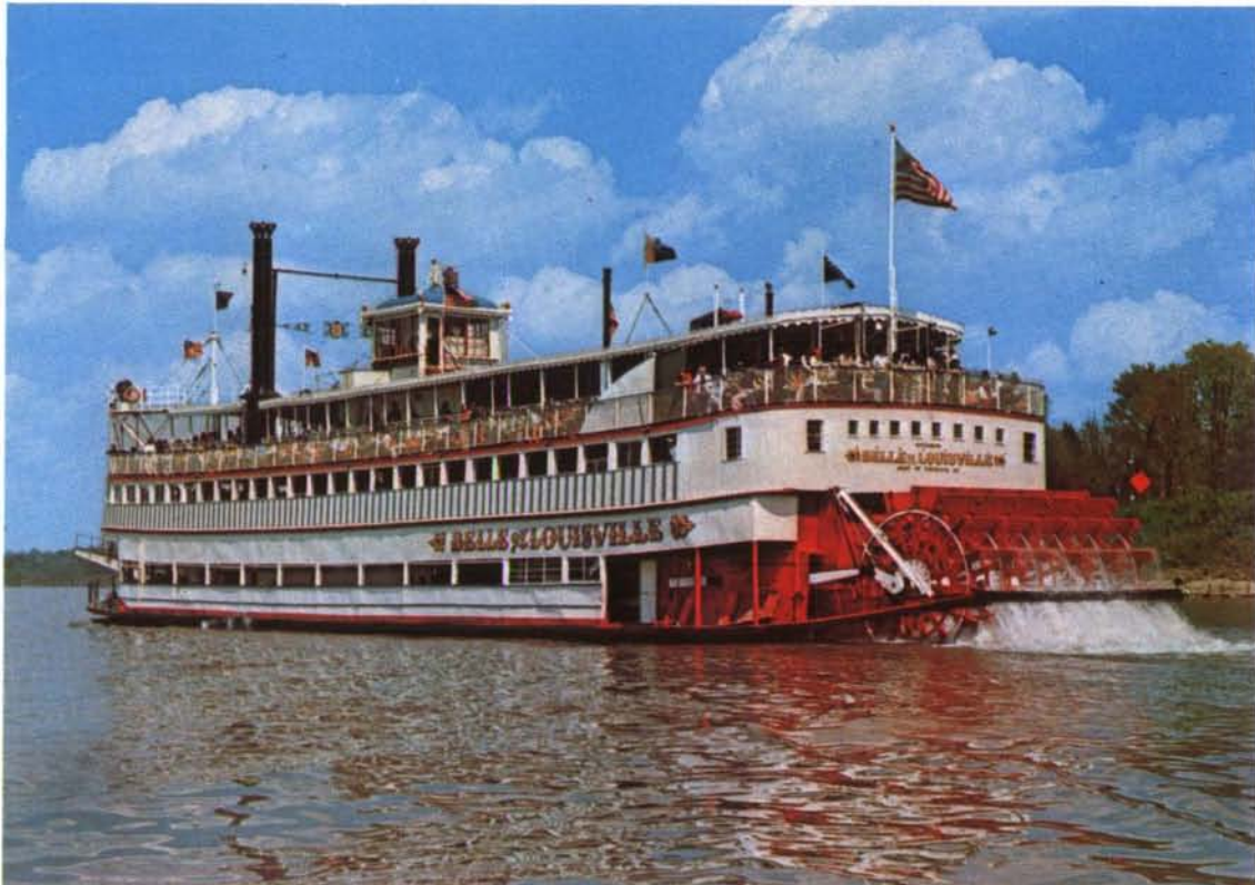
The Belle of Louisville will provide a relaxing afternoon for Conventioneers on recreation day Tuesday. Further information on this tour is on page 8.