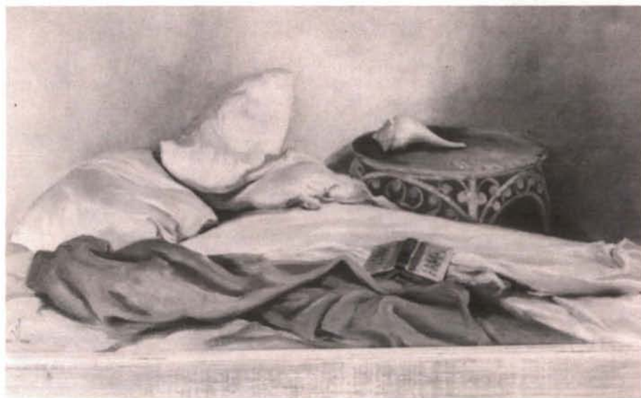
The Shell (Oil)