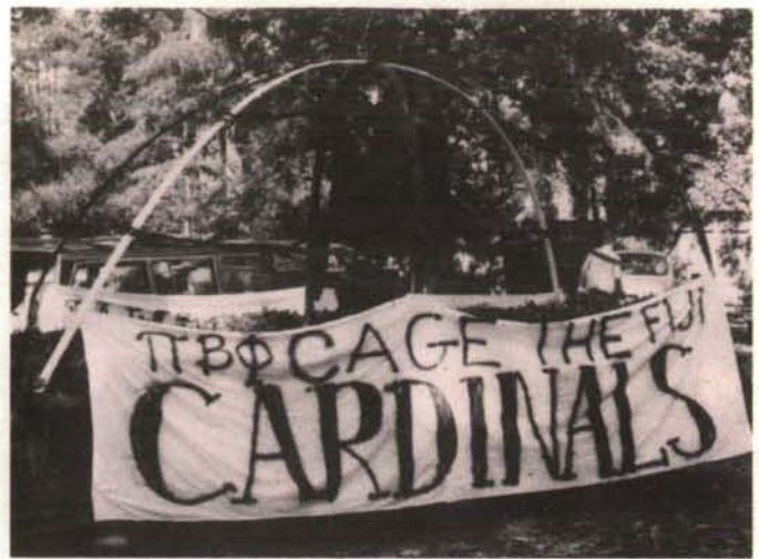
Ohio Delta Pi Phis teamed with the Fijis to build a float for the Fallfest Homecoming celebration at Ohio Wesleyan. The collaboration began at 6:30 a.m. with a wake-up breakfast at Fiji and continued with work throughout the day and well into the night.