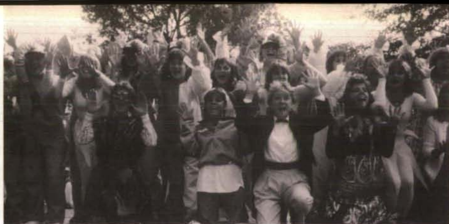
Pi Phi at the University of Alabama had more than a football victory to celebrate at Homecoming. The pledges won third place in the choreography competition with a four minute song and dance routine exemplifying the 1982 theme, "The Greatest Homecoming on Earth." Actives did their part also and won first place in lawn decorations.