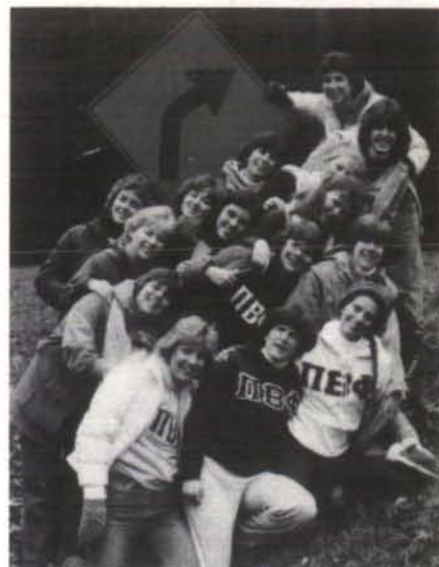
The Ohio Epsilon chapter from the University of Toledo recently had a weekend retreat at the Hocking Hills State Park in Southern Ohio. Would you say that Pi Phis have a special bent for arrows?