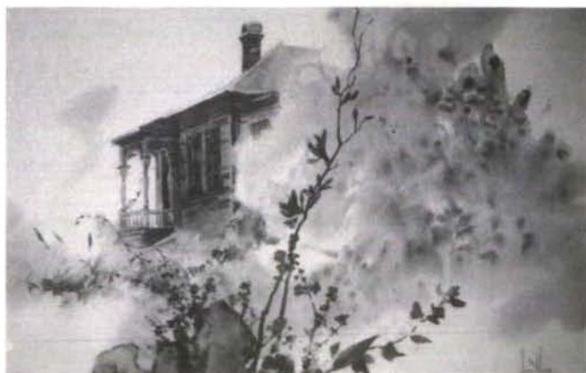
Dream of Key West (Watercolor)