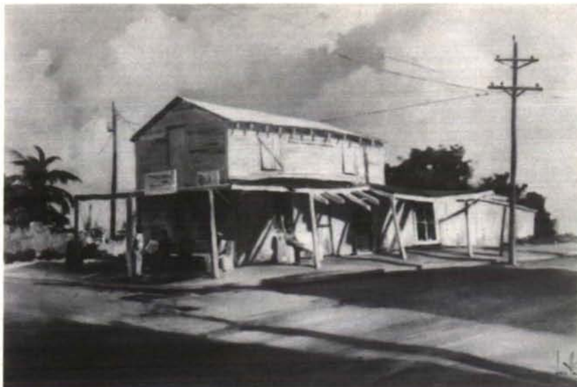
Fishermen's Cafe (Oil)