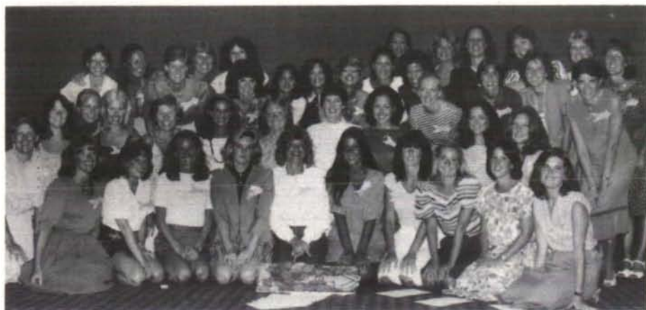
Indiana pledges from 1973-1977 gathered last July to reminisce.