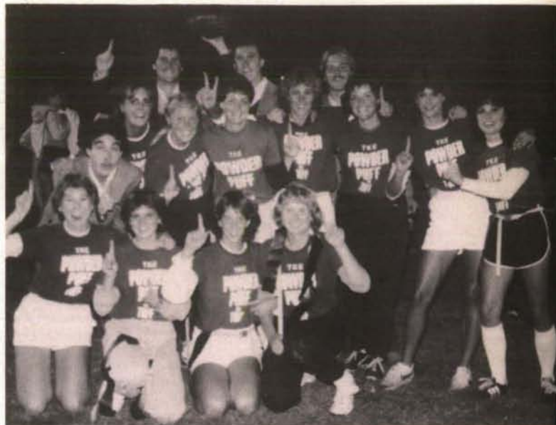
The Kansas Beta football team took not only the K-State intramural championship, but also won the annual Puff Bowl, sponsored by Tau Kappa Epsilon. The team and TKE coaches proudly indicate their #1 status after the competition.