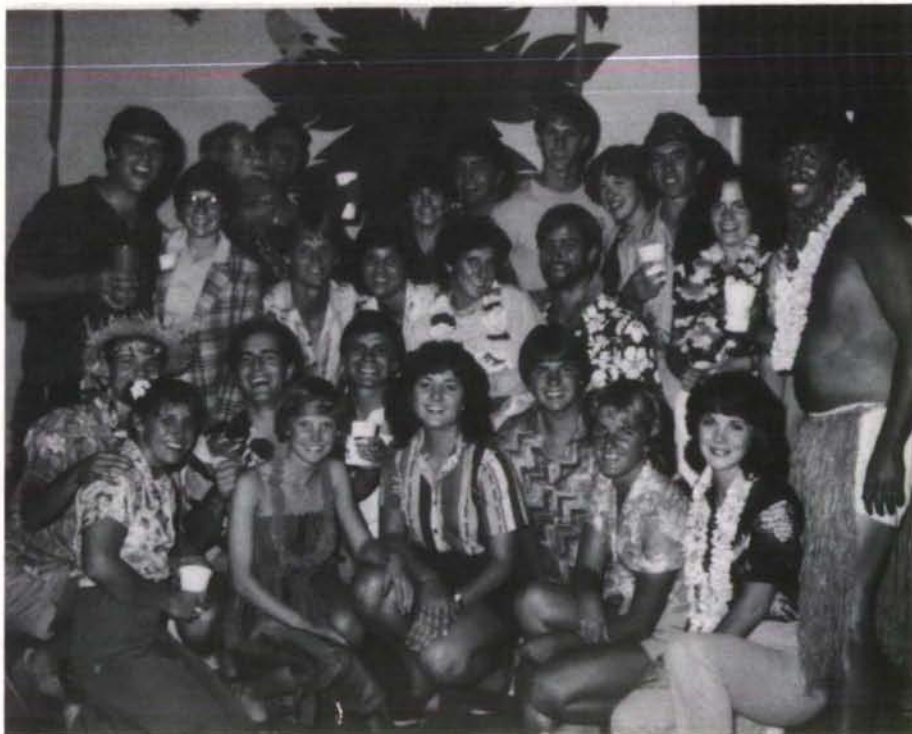
Pi Phis at Colorado State are especially glad that their neighbor is the Farm House fraternity. Thirteen Pi Phi-Farm House couples "surfed" into the Pi Phi house in October for their annual Mystery Date dance.