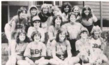
Spirit and hard work certainly paid off for Illinois Theta. The girls took first place in four of Bradley's Greek Week main events and became 1982 Greek Week champions.

The gathering together of pledges, actives, and alumnae at N.C. Beta's 50th Anniversary celebration was proof in itself of this fact. The banquet was not only a great deal of fun, but it was also a solemn occasion that was inspirational to all present. It heightened everyone's awareness of just how far wine and blue bonds extend—everywhere and always.