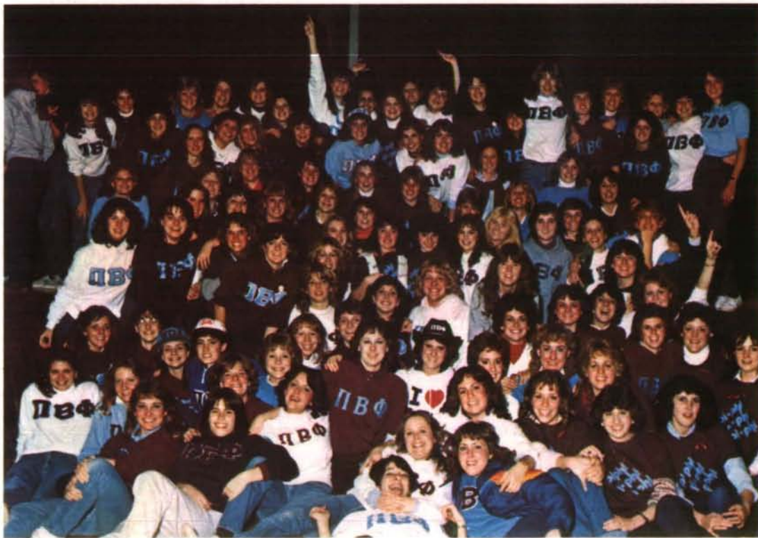
NEWEST—BIGGEST—And surely one of the best! Virginia Zeta, only one year old, became the largest Greek organization on the Virginia Tech campus with the pledging of 21 women during winter quarter.