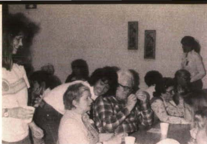
Arizona Betas has a special good time when they visited a local retirement home and performed one of their rush skits.

privileged children from the Desire Housing Project in New Orleans. Everyone had fun making Christmas cookies and playing games. Later the Pi Phis took the same children swimming in the university pool.