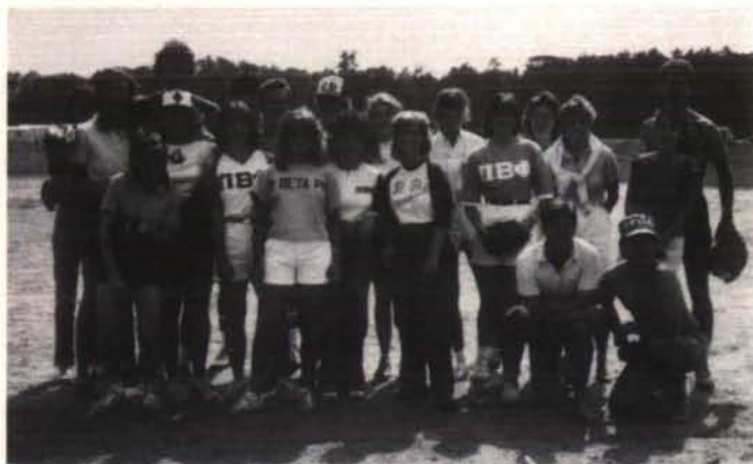
Florida Alphas and their coaches take a break on the softball diamond after an exciting game at Stetson.