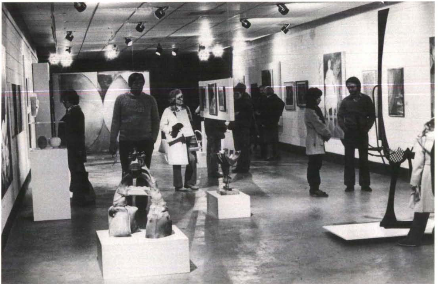
During the opening reception of the University of Tennessee Art Faculty and Graduate Student Exhibition in the Arrowmont Gallery, visitors admired the many beautiful, though sometimes unusual, pieces on display.