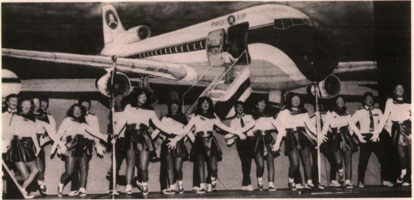
The winning production in Varsity Revue at Oklahoma State was presented by Pi Phi and Beta Theta Pi.