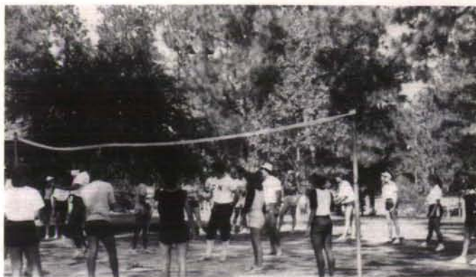
Volleyball, anyone? Mississippi Alpha is currently in second place overall in intramurals at the University of Southern Mississippi. This co-rec volleyball team has a third place standing.

Mississippi Alpha is very involved in all sports at Southern Mississippi and has racked up second places in bowling and