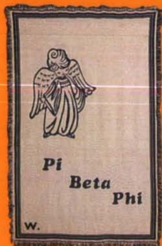
W. Beautiful angel afghan with Pi Beta Phi in cream and light blue. 46 inches by 67 inches. N100 $40.00