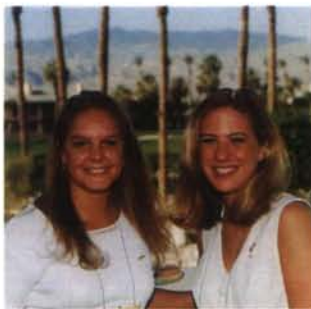
CLOCKWISE: Collegians take a break on one of the patios of the hotel.