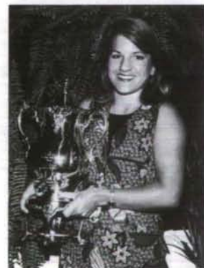
Marianne Reid Wild Award —Austin, Texas