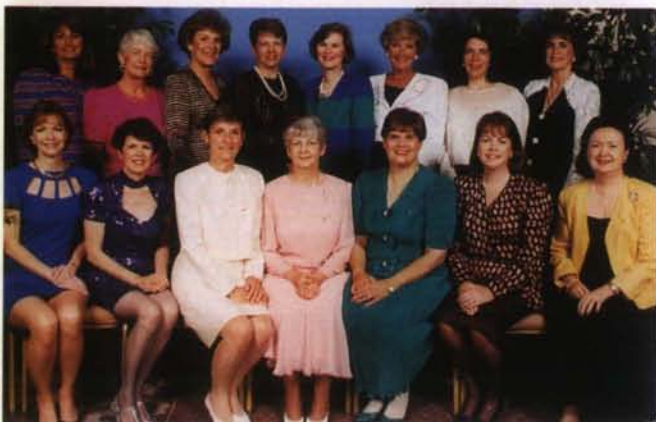
Members from Iowa Beta at Simpson College celebrate taking home the biggest award of the convention—the coveted Balfour Cup for Pi Beta Phi's best collegiate chapter.