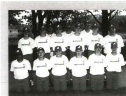
The Arrowmont logo graced Sevier County baseball fields this summer. A donation of $300 allowed the school to sponsor a team, thereby providing uniforms and necessary equipment. Many players on the Arrowmont baseball team are students at Pi Beta Phi Elementary School.