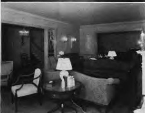
WISCONSIN ALPHA'S HOME

Top: Library. Bottom: Looking into library and hall from living room.