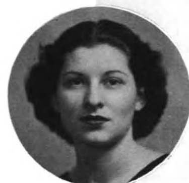
Right VIRGINIA TEHAS D.C. A