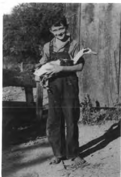
A "FUTURE FARMER OF TENNESSEE"

done our share for the school and are no longer needed. No Pi Phi's share is ever done. Now we have a whole new set of needs