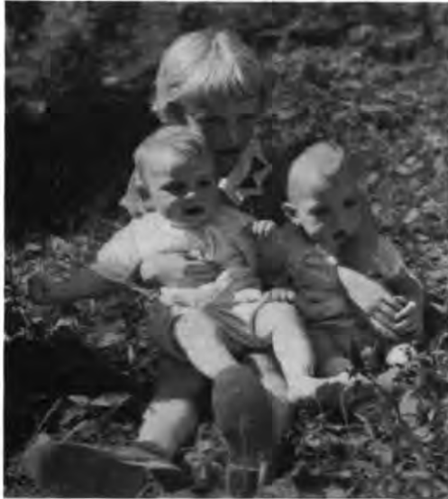
A SET OF APPALACHIAN TWINS WITH "NURSE"

the patterns for her weavers, whose workmanship she checks after instruction in their homes. She handles both the stock of raw material and manufactured articles. She takes an active interest in the weavers as person-