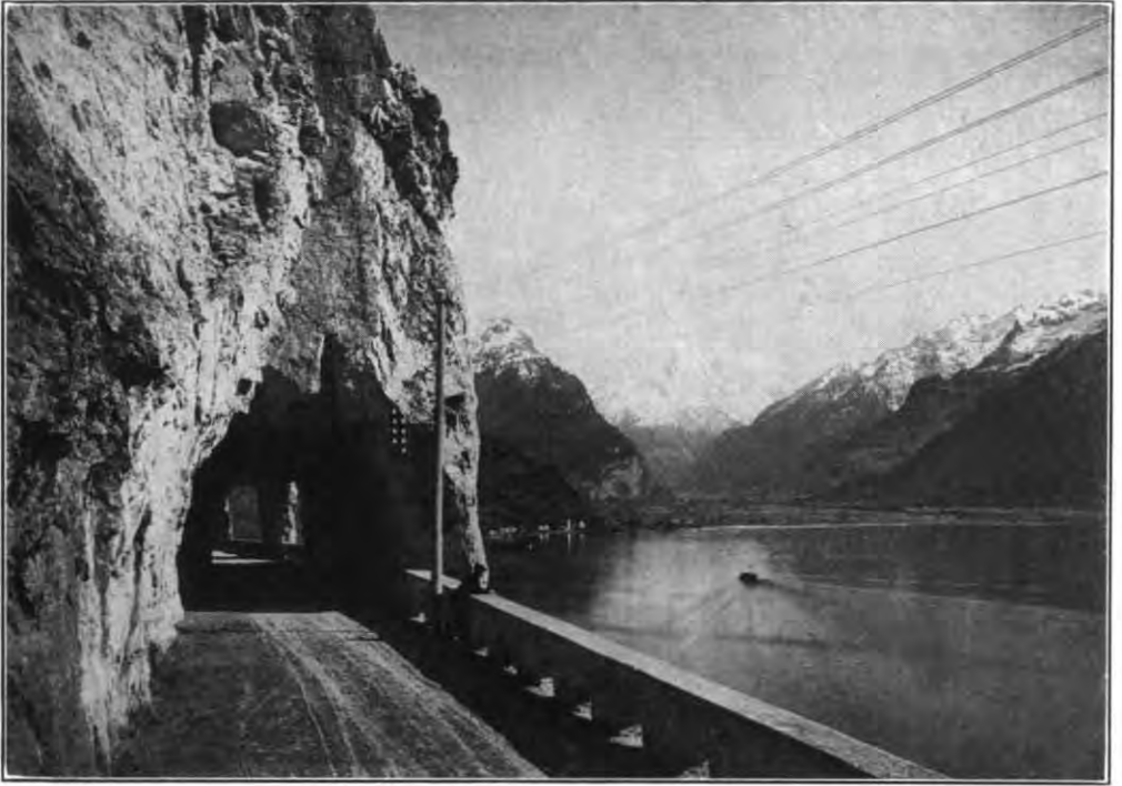
THE AXENSTRASSE, SKIRTING THE LAKE OF LUCERNE