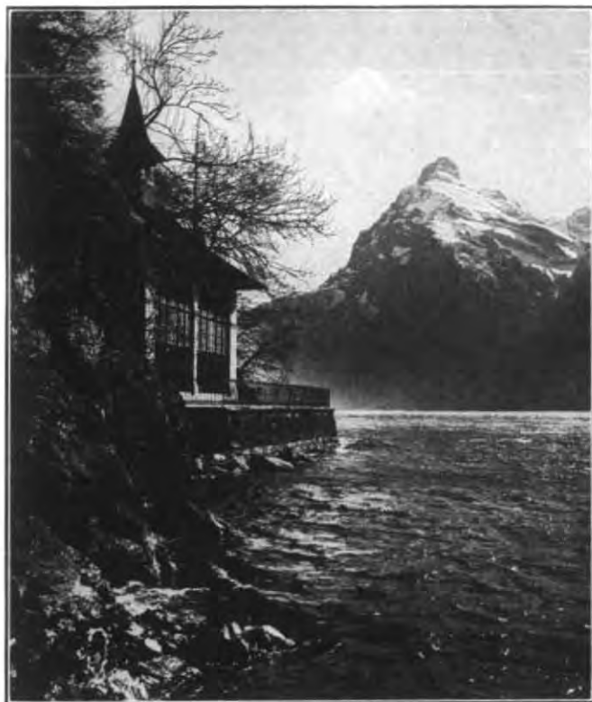
TELL'S CHAPEL ON LAKE LUCERNE, SWITZERLAND

Of exceptional interest this year will be