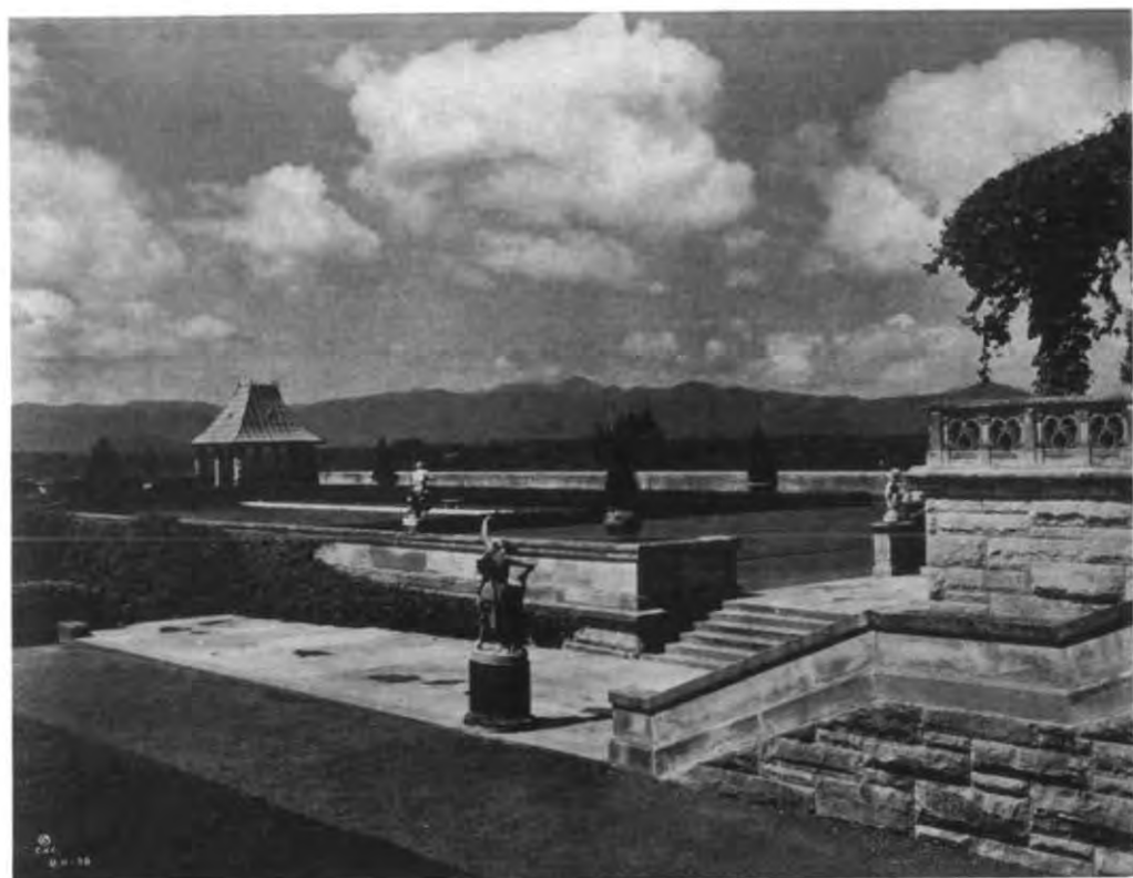
LIBRARY TERRACE—BILTMORE HOUSE AND GARDENS