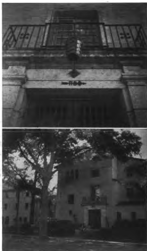
TWO VIEWS OF FLORIDA GAMMA'S HOUSE

The Indianapolis alumnae club of the chapter and Lee Burns presented the lighting fixtures, which include crystal chandeliers and lanterns, all authentic colonial reproductions.