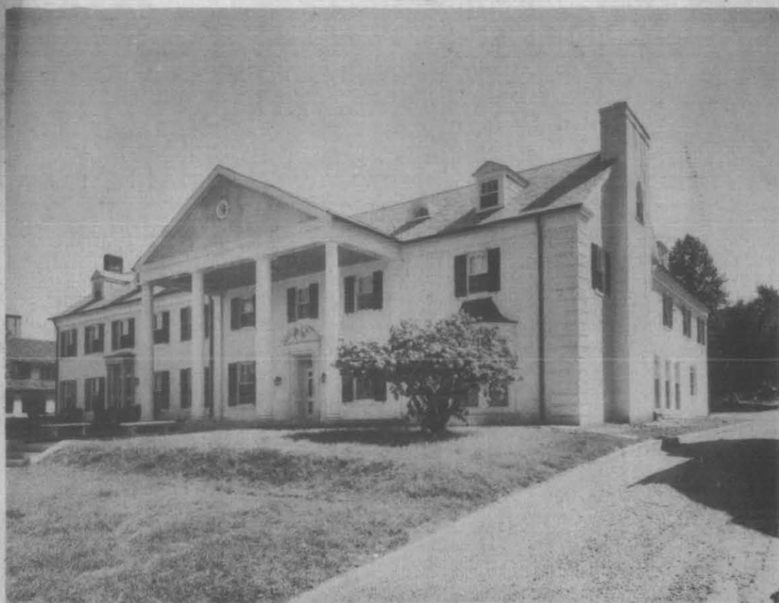
INDIANA BETA CHAPTER HOUSE