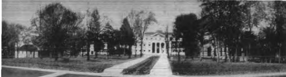
Monmouth College Campus

ON APRIL 28, 1942, Pi Beta Phi passed her 75th milestone!