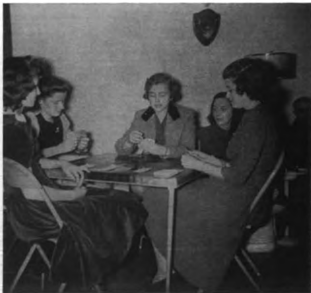
Kansas B plays bridge.