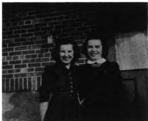
Pi Phi sisters in Montana A chapter.