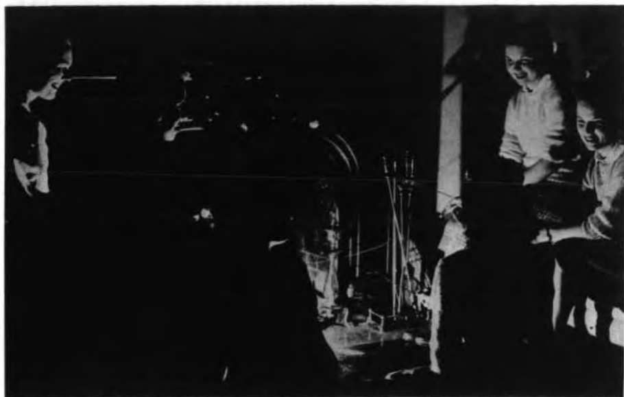
Group of Texas A actives roasting marshmallows at the open fire in the chapter house.