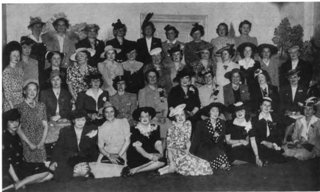
Alpha Province West Conference, Rochester, New York, May 16, 1941.