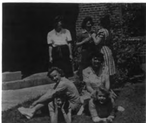
A group of Pi Phi before our chapter house door, Montana A chapter.