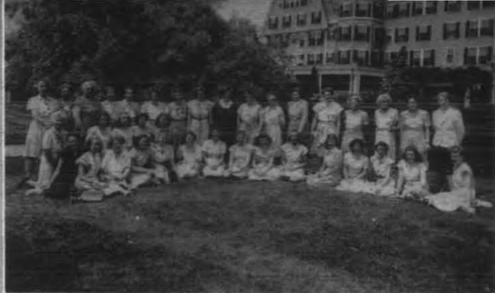
Mothers and Daughters at Convention