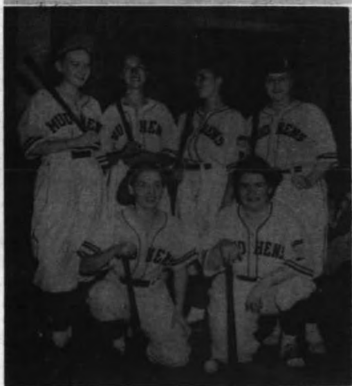
Toledo Alumnae Team