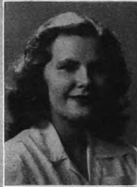
Mary Nelle Park Missouri A