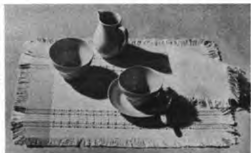
One of the New Doily Designs the Clubs Will Be Selling This Year.

formal workshop plan where work either for University credit or on a non-credit basis was available in Crafts and Community Recreation.