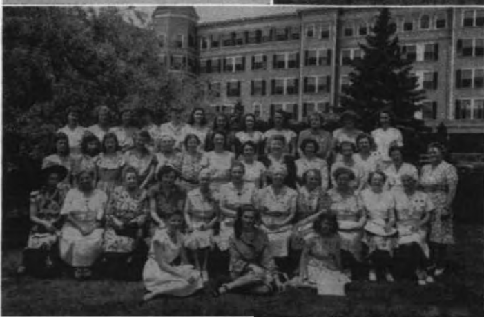
Alpha East Province