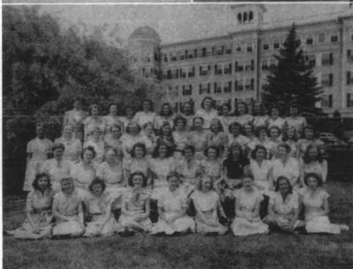
Mortar Boards at Convention