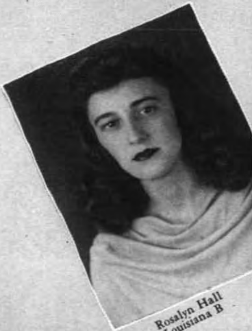
Rosslyn Hall Louisiana B