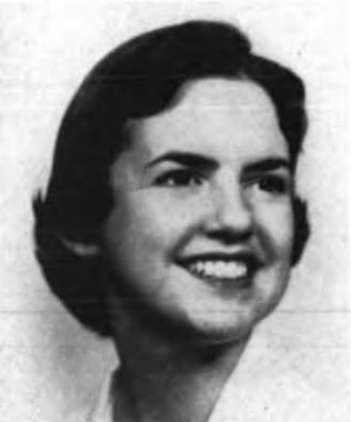
Virginia Catching Virginia A