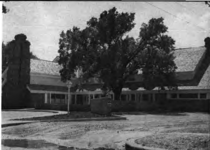
New home of Oklahoma Beta

A lovely new home welcomed the Oklahoma Betas as they returned to classes this fall. The members were filled with excitement and wonder as they toured their new home for the first time. Each girl was overwhelmed with gratitude to everyone who had helped make this dream come true.