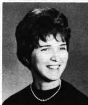
Mae West West Virginia A Spokes