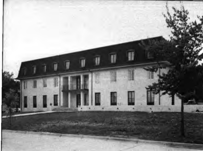
Kansas Beta's new home