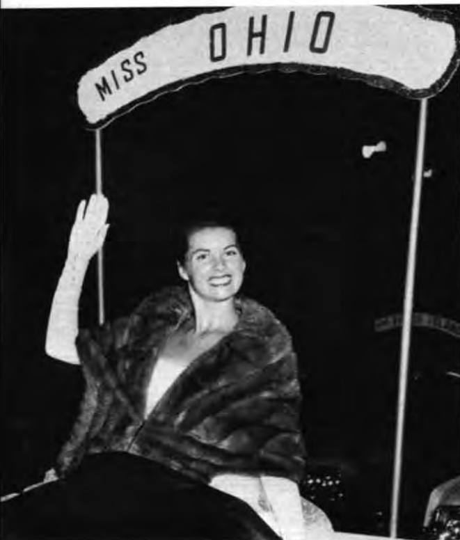
A big Ohio smile in Atlantic City parade.

Suddenly she was no longer Jackie Mayer, a 20 year old girl who couldn't decide for herself whether to continue to travel with Fred Waring and his Pennsylvanians or to return to Northwestern University in the fall of '62; for now she was "Miss America," Jacquelyn Jeanne Mayer, the American ideal of womanhood and reigning beauty of the world. Her life was no longer her own and for a full year she would have to discard her previous plans in order to become this shining goddess of beauty, talent and personality.