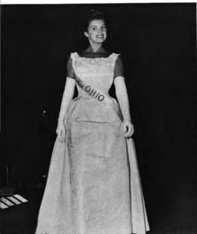
Along the ramp before millions of television viewers and the judges.