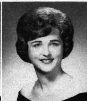
Lil Cross Alabama Gamma Theta