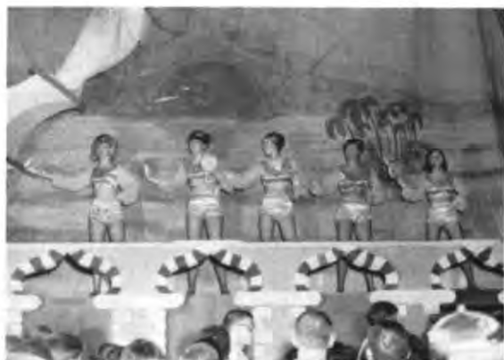
Minnesota Alpha chorus line

The thrill of winning these honors was surpassed