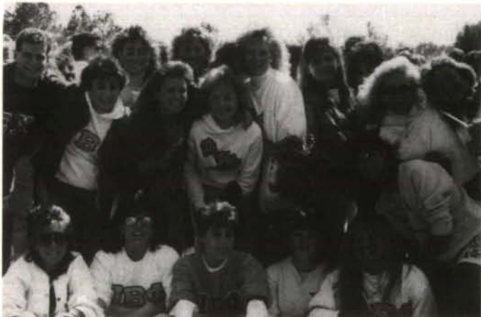
Florida Deltas sport their jerseys and letters at Field Day in Greek Week. The chapter has been on the University of Florida campus for only two years and has won second place in Greek Week both years. This year "Greeks Look to the Skies" was the theme and the week raised over $12,000 for Stop Children's Cancer.