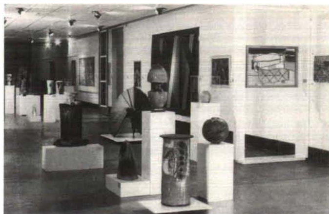
A multi-media exhibition of pieces from the Arrowmont Permanent Collection.