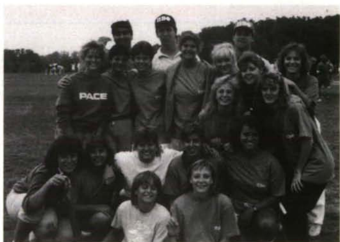
Georgia Alpha's football team ended the season with a 6-1 record after losing to the Vet School in the first game of the playoffs. They were undefeated in regular season.

COLORADO DELTA won championships in soccer, swimming and racquetball.