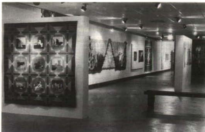
Arrowmont Gallery during the "New Quilts of the Mid-South" Exhibition, February 22-March 29.