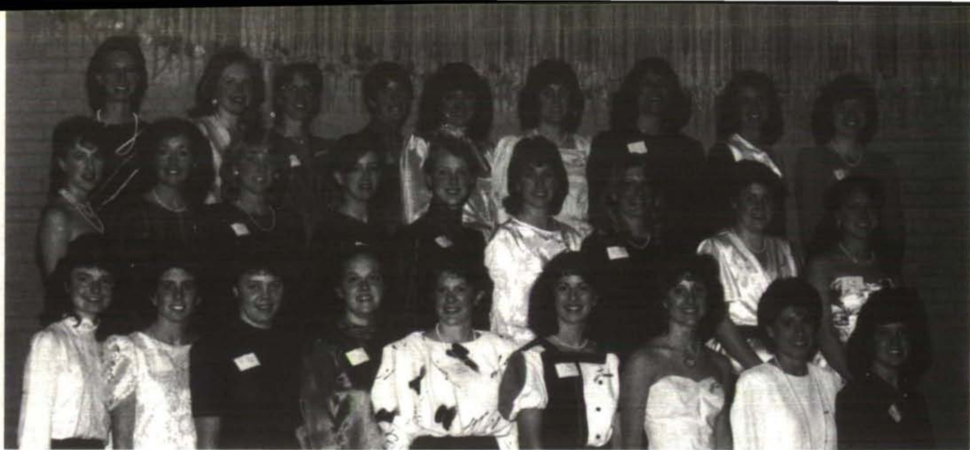
Charter members of Colorado Delta at Colorado School of Mines.