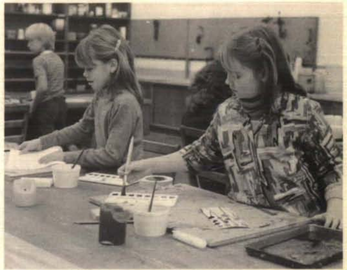
Pi Beta Phi Elementary School students work with various watercolor techniques at the Children's Art Workshop.

Costs for the workshop include tuition $75.00, room and board $90.00 to $115.00, materials fee $30.00 and non-refundable processing fee $20.00. Would your club like to give a scholarship to someone in your community, or . . . what about grandmothers, great aunts, aunts, mothers giving financial assistance to those juniors or seniors who might not otherwise have the opportunity of attending Arrowmont?