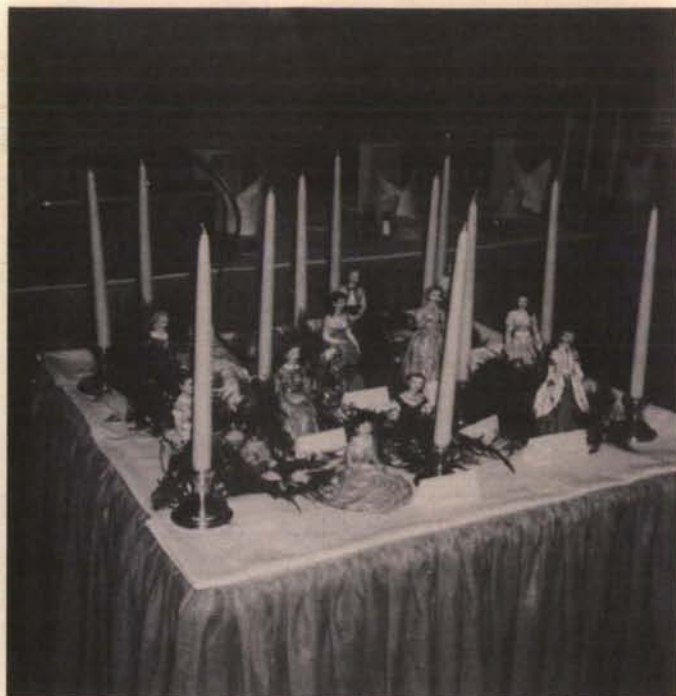
In front of the head table at the installation banquet was one of two sets of Founders dolls in existence, dressed as they would have been in 1867. This set belongs to the Northern New Jersey Alumnae Club and the Pi Phi who made them is deceased.

We wish Pennsylvania Eta well as they begin their association with Pi Beta Phi.