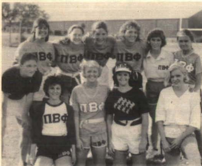
Texas Delta once again finished strong in last fall's intramural competition at TCU. In both swimming and volleyball, Pi Phis were number one, and they finished second in flag football.