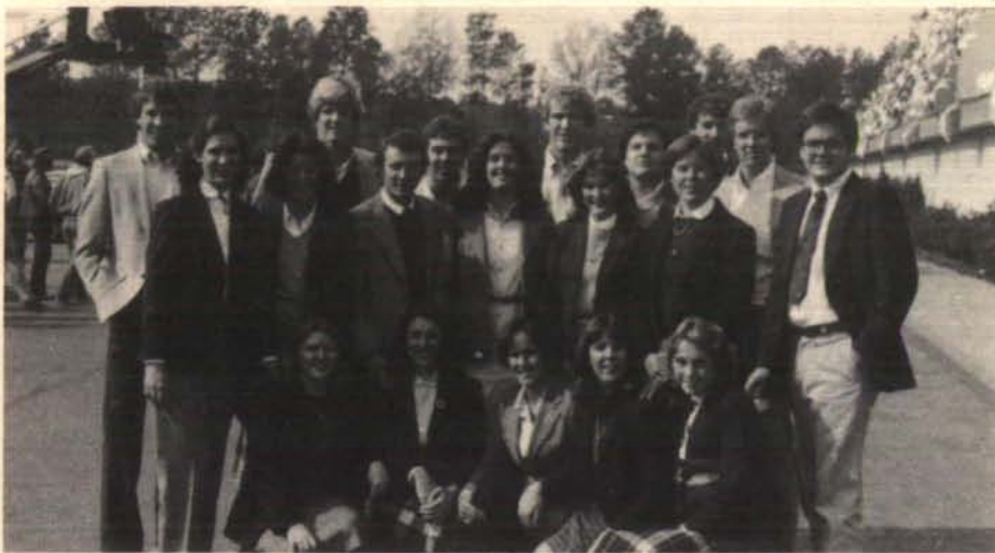
Alabama Betas and their dates at Greentrack.