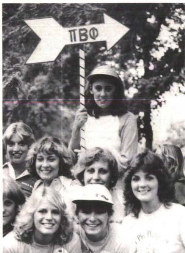
Indiana Zetas showed great spirit and campus participation by entering three teams in the 1980 Watermelon Bust Festival.