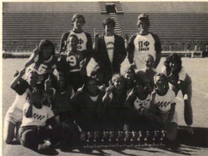
Arkansas Alpha's flag football team is the 1980 Superbowl Champion in the University of Arkansas Intramurals.