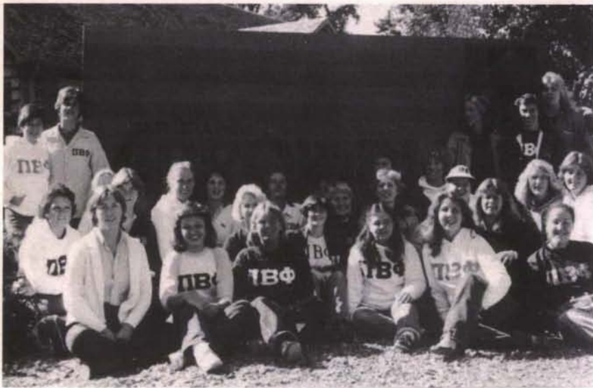
Kentucky Gammas from Eastern Kentucky University posed for this picture after touring the Arrowmont complex in Gatlinburg. The chapter spent a weekend retreat in the Red Barn on the Arrowmont campus last October.