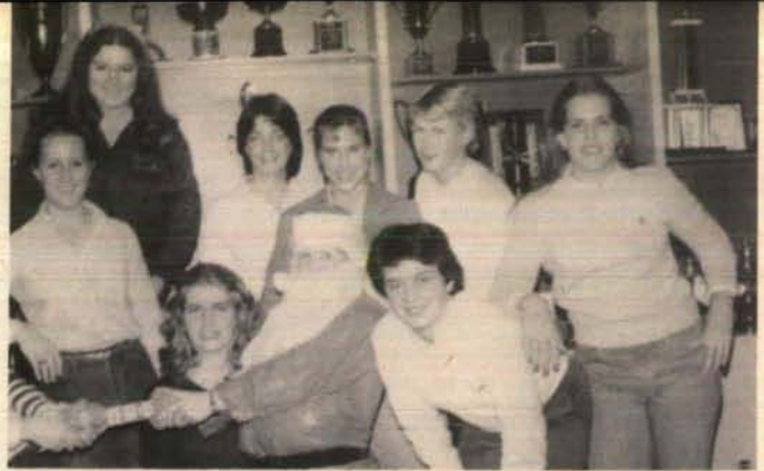
Tennessee Gammas proved their excellence in athletics at the University of Tennessee by placing first in all-sorority tugging and second all-university.