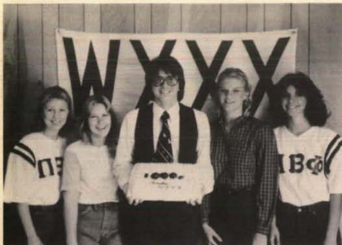
Mississippi Alpha teamed with radio station WXXX to raise money for Arrowmont and the Hattiesburg Humane Society. Each Pi Phi sold two 30-second spot announcements for Radio Day and $656 was raised. The chapter also raised money for Special Olympics and participated in the Red Cross blood drive.