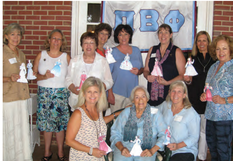
Above: Pensacola, Florida, Alumnae Club members.

In September, the Indianapolis Alumnae Club hosted the Champions are Readers program for the 12th year. The women read with second graders at Greenbriar Elementary School over four weeks, visiting a total of six classrooms. Club members with previous teaching or tutoring experience were paired with struggling readers and the one-on-one reading help benefited those children. The program culminated with a party and book fair where each student selected four books to take home.