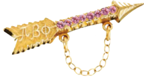
PINK SAPPHIRE BADGE $250