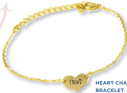
HEART CHARM BRACELET Gold-plated $30