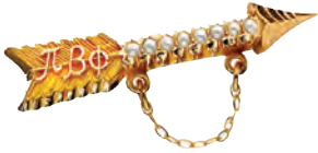
PEARL BADGE $225