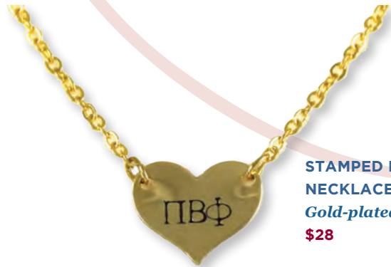
STAMPED HEART NECKLACE Gold-plated $28