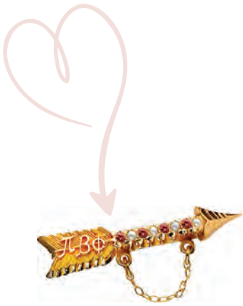
GARNET AND PEARL BADGE $250