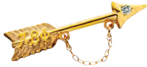
DIAMOND POINT BADGE $200