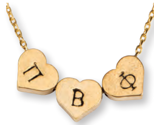
GREEK LETTER HEARTS NECKLACE Gold-plated $28