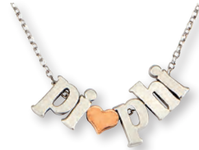
PI PHI HEART NECKLACE Silver-plated $28