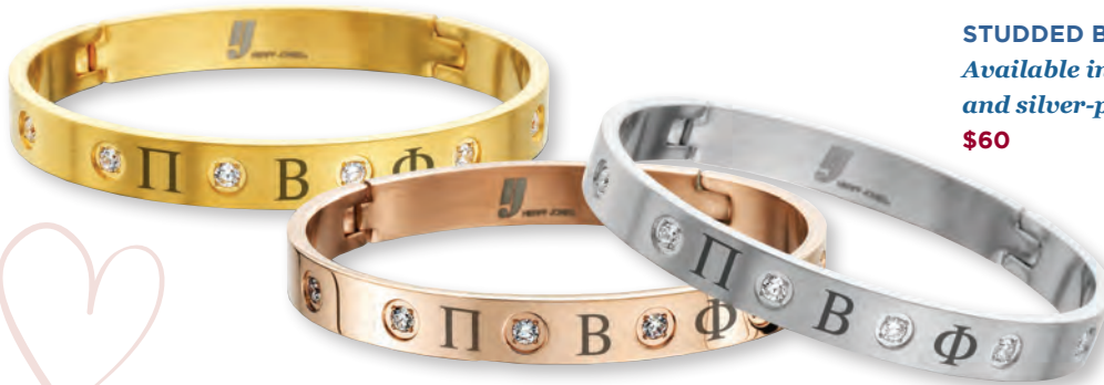
STUDED BANGLE Available in gold-plated, rose gold-plated and silver-plated $60

All jewelry is sterling silver or 10k gold unless otherwise noted. Jewelry may be enlarged to show details.