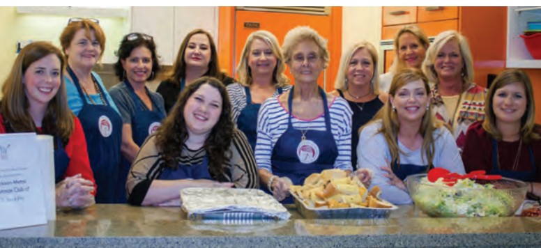
Below: Jackson Metro, Mississippi, Alumnae Club members.

In October, the Bostonian, Massachusetts, Alumnae Club welcomed the Ring Ching Roadshow to the greater Boston area with several events including dinner at a local Italian restaurant and an ice cream social with the Massachusetts Gamma Chapter at the Massachusetts Institute of Technology. The club also held its annual apple-picking event during the visit at Bolton Spring Farm, providing a true taste of autumn in New England.