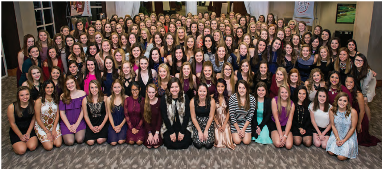
Above: In November, Pi Beta Phi welcomed back the South Carolina Beta Chapter at Clemson University. Many South Carolina Beta alumnae and Pi Phis from across North America joined the 159 South Carolina Beta collegians to celebrate the chapter's return.