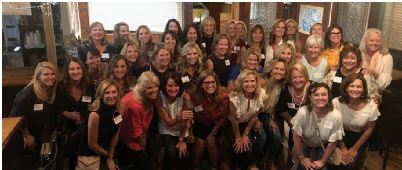
Sisters by blood and Pi Phi celebrate the wine and silver blue!