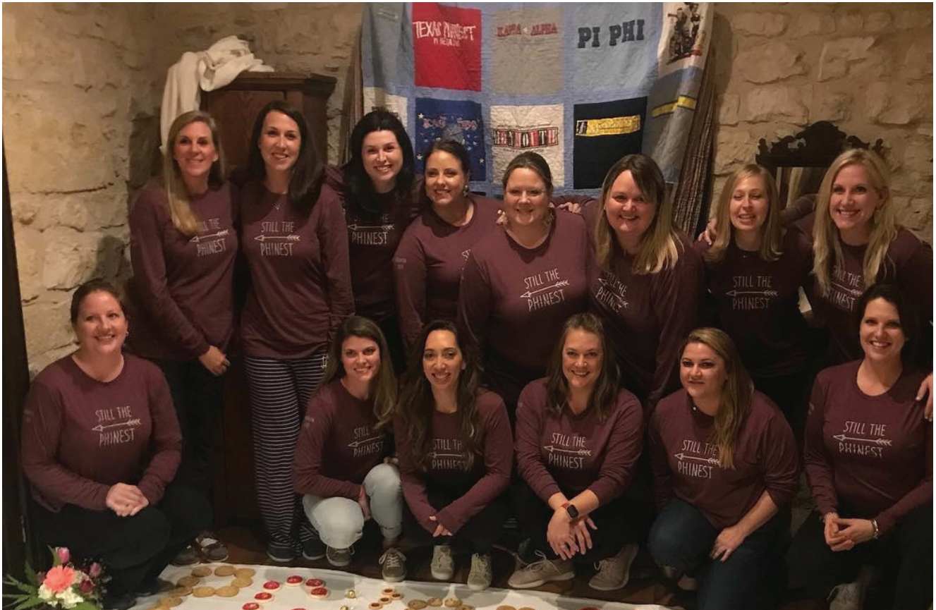
The 1998 New Member class of Texas Eta celebrate with a Cookie Shine!