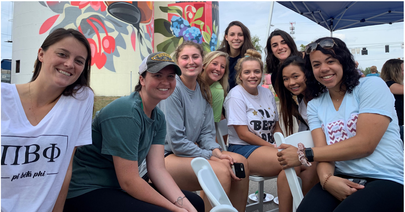
Indiana Epsilons participated as volunteers at the Putnam County community block party to celebrate the completion of the first Putnam County Mural Project.

The celebration began with video highlights from the 2019 Convention in Washington D.C., attended by chapter officers and advisors. The video featured the moment