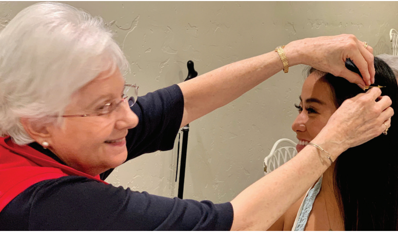
A member of the Tucson Alumnae Club pins an arrow hair clip into a New Member's hair at their annual sisterhood event.