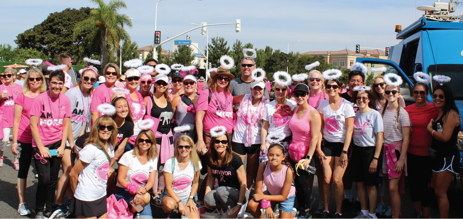
Pi Phi alumnae, friends and legacies of the South Coast, California, Alumnae Club gathered to support those battling and surviving breast cancer.