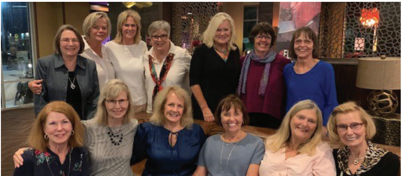
Sisters of Missouri Alpha embrace each other and celebrate decades of friendship.