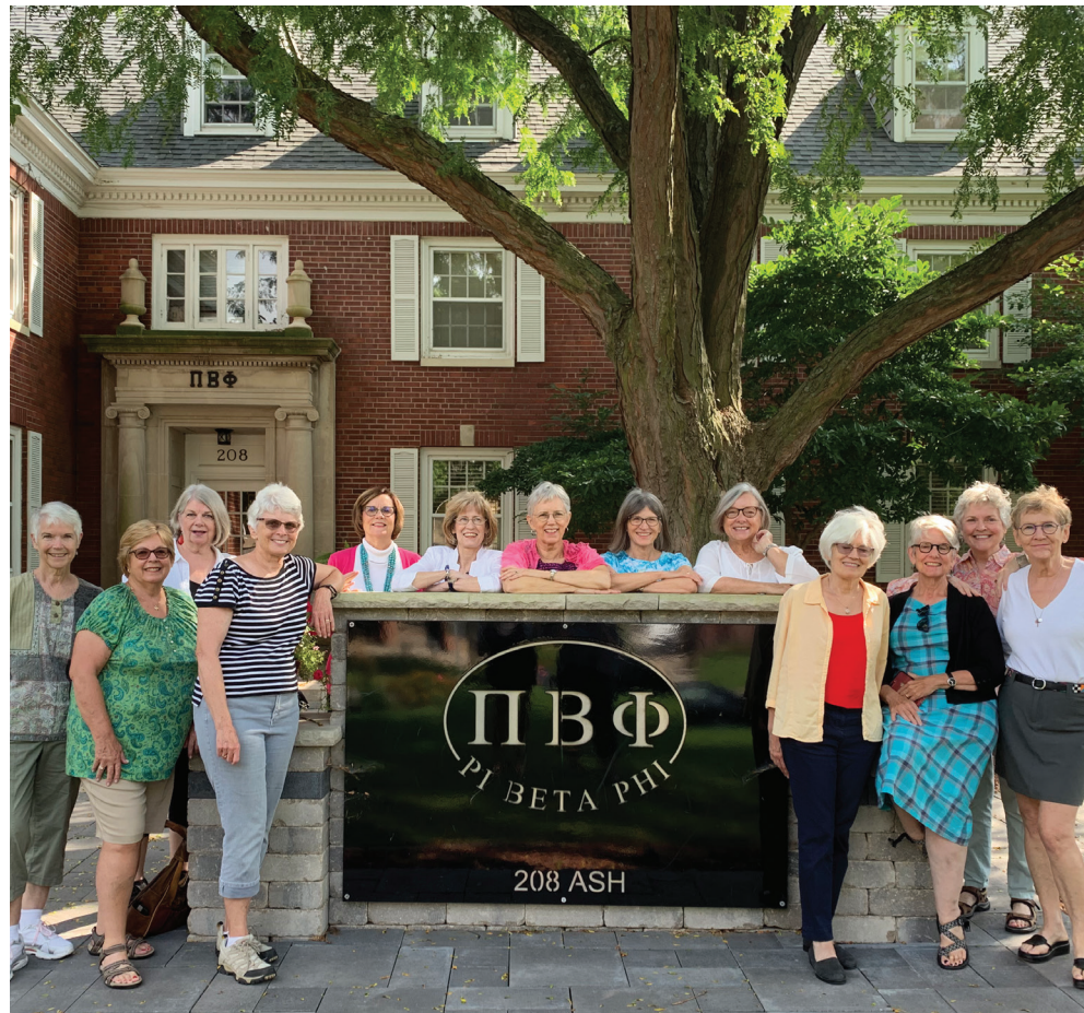
Fondly remembering life at the Iowa Gamma Chapter house.

Members from the 1965 and 1972 New Member classes returned to Ames to celebrate the Sincere Friendship that has lasted far beyond their college years. The love and energy flowing from the women as they walked through the chapter house was electric. Laughs rang out as they reminisced on sweet memories of life at 208 Ash.