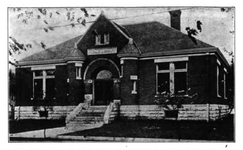
Public Library, York, Nebraska.-Established by Nebraska Alpha of Pi Beta Phi