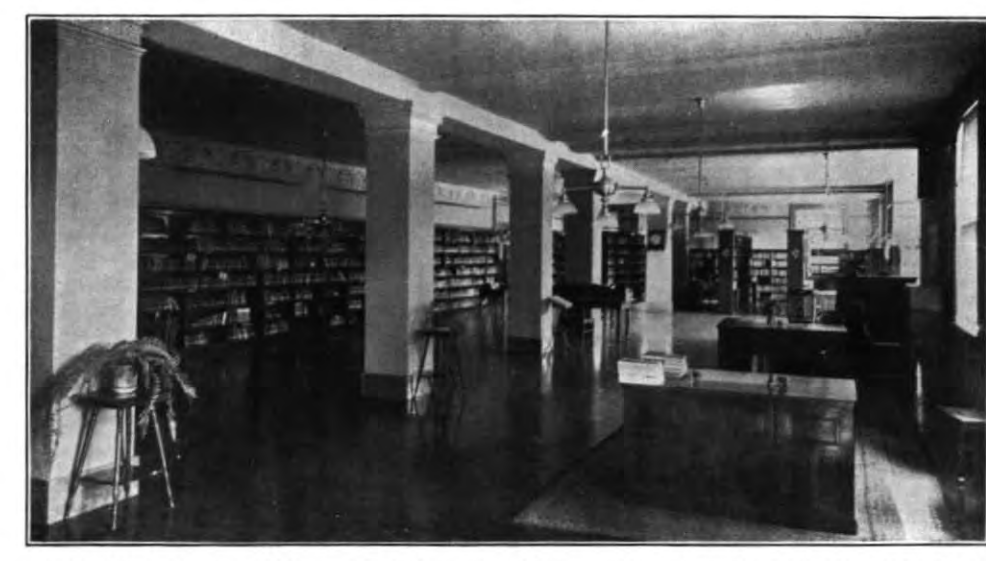
Library Commission, Historical Building, Des Moines. Free Traveling Library of the State of Iowa