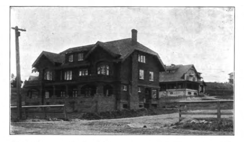
Chapter House, California Alpha