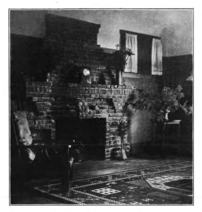
Living-room, California Alpha