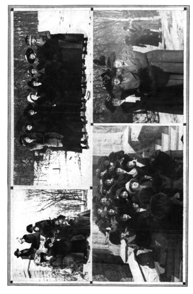
EIGHT OF THE FRESHMEN THE THREE SENIORS SNAPSHOTS OF ILLINOIS EPSILON THE SPRING MAIDS ON THE UNIVERSITY STEPS