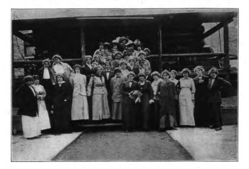
Lunch at "The Alps" During the Province House Party

The main feature of the evening however was a formal meeting. Pi Phi's extension policy was discussed and the girls showed a wide-