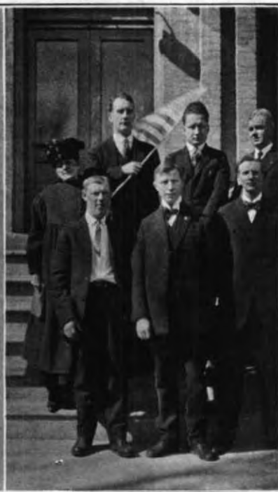
LARAMIE, WYOMING, CLASS IN NATURALI- ZATION ON THE COURT HOUSE STEPS, MARCH 8, 1917