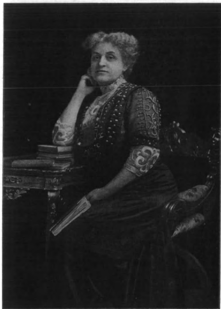
CARRIE CHAPMAN CATT