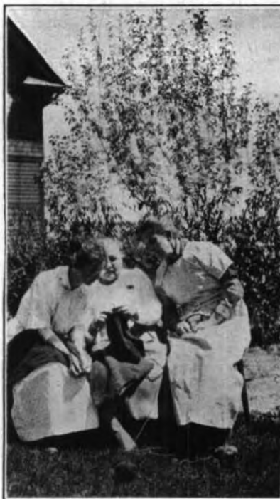
A KNITTING LESSON