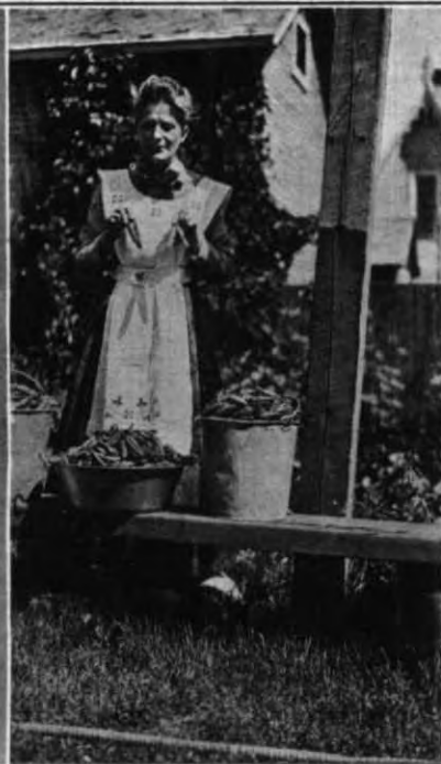
JUST FINISHING PICKING 33 QUARTS OF PEAS FOR COLD-PACK CANNING