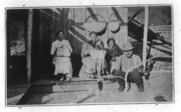
SOME OF THE BASKET-MAKERS

Our baskets are made from the following interesting interesting willow switches (reeds), willow bark, white oak splits, and corn husks. In some sections the baskets are colored, but we have not