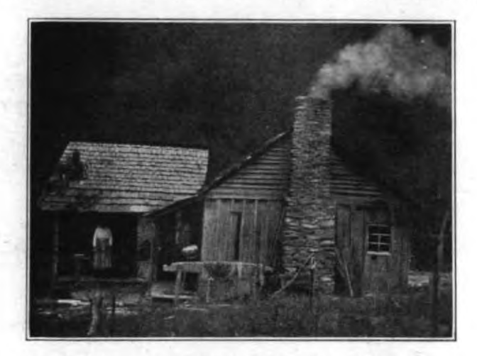
A HOUSE WHERE MANY BASKETS HAVE BEEN MADE FOR THE PI PHIS

Owing to the recent demand for wool for army use only a very few "Kivers" have been made. With the great advance in price of the raw materials, wool, cotton, and dye-stuffs, which go into one of these