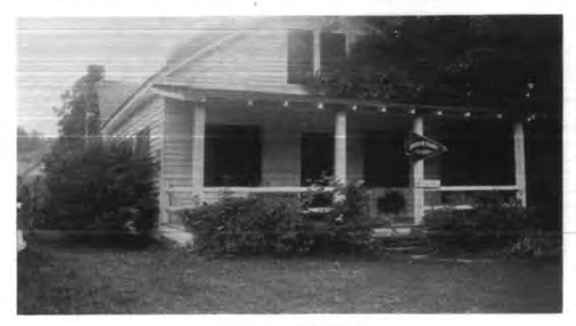
ARROW CRAFT SHOP