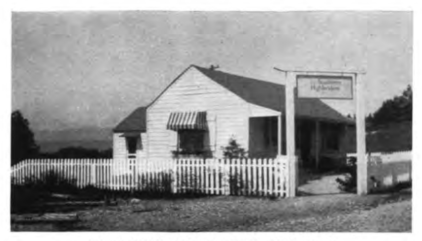
SOUTHERN HIGHLANDERS' SHOP, NORRIS DAM