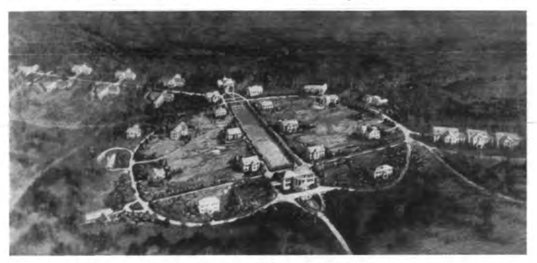
LAURELTON STATE VILLAGE, PENNSYLVANIA

Girls have been on parole, and 85 per cent of these paroles have been successful. At the end of five years the per capita cost of the 194 girls paroled had saved the state