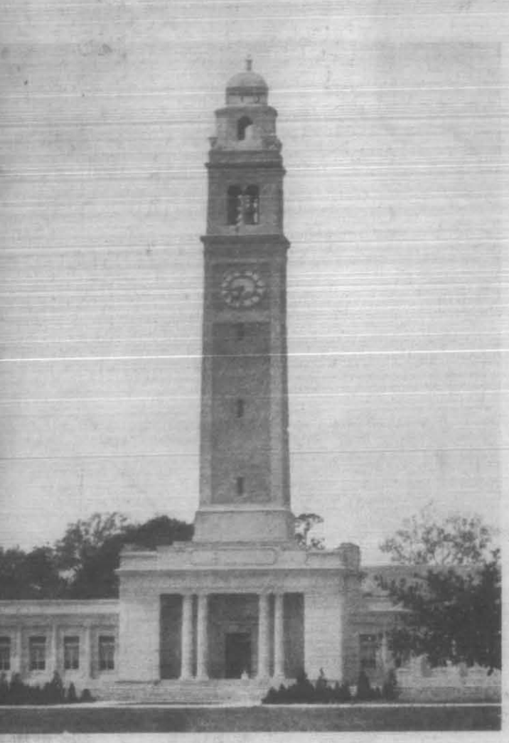
LOUISIANA STATE CAMPANILE