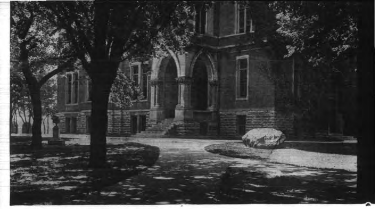
East College and The Boulder, De Pauw University