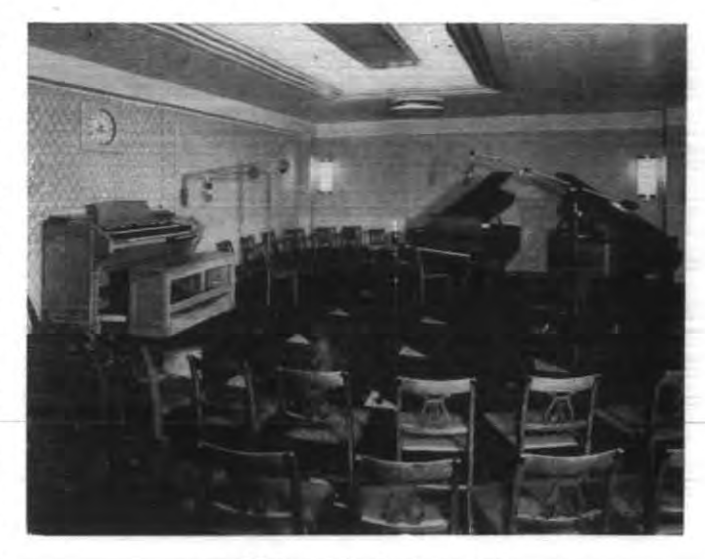
Radio Room in Harrison Hall

With the charm of a small college town, an interested and understanding administra-