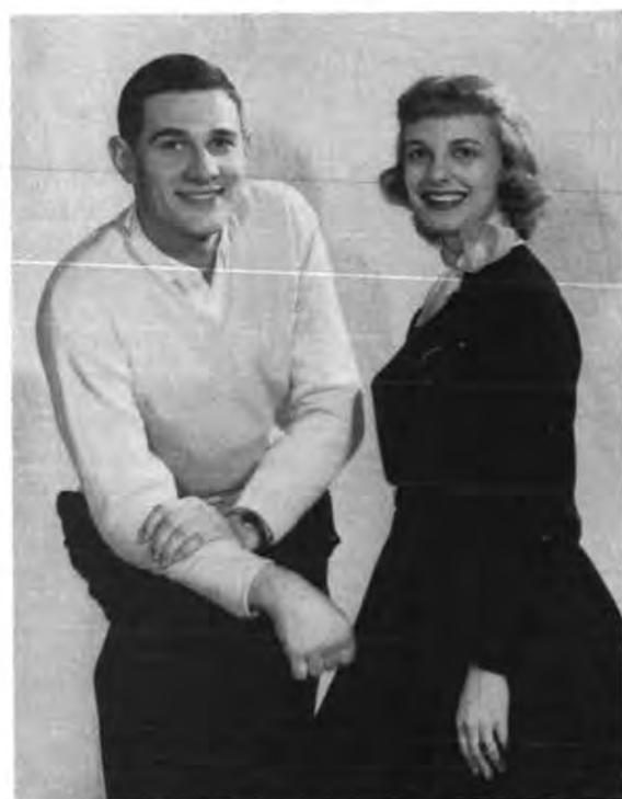
St. Pat and St. Patricia