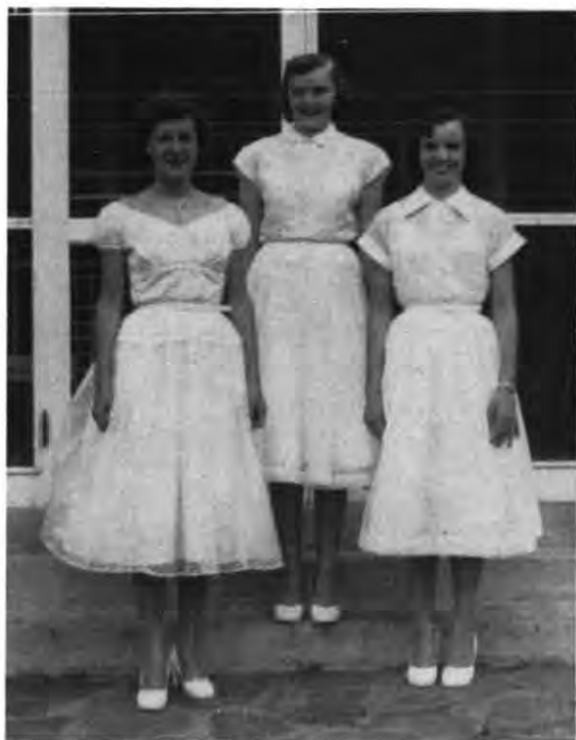
Three Dormitory graduates, June 1955, on the steps of the Ruth Barrett Smith Staff House.

In return for their board and room the students pay $5 per month plus giving 96 hours in work assistance. The girls help with housework not only in their own dorm, but in Staff House as well. They have proved invaluable help when the Staff House has been temporarily without a cook, for they manage to get breakfast and help with the other meals. The training they receive in serving has meant good jobs for many in the dining rooms of the big hotels of the town. The opportunities they have to assist with receptions and teas in the Staff House are assets in their social training and the boys and girls alike learn the fine art of hospitality when they entertain their classmates at parties, or assist with girl scout or boy scout benefits in their "homes." Work for the boys may be in helping with farm chores, shoveling snow, keeping the fireplace wood-box filled, or doing any number of odd jobs. A fine contribution this year is their effort in helping