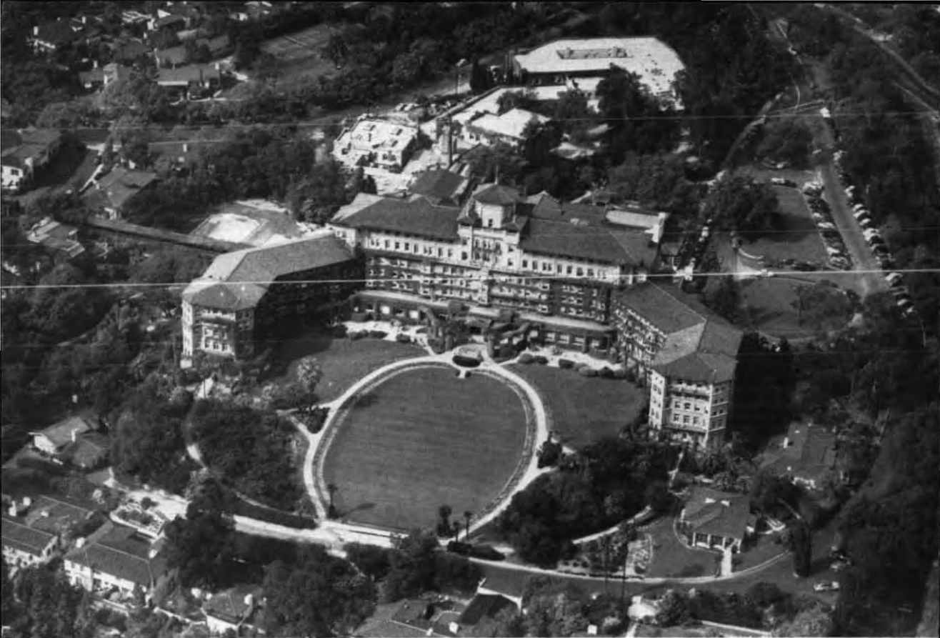
Aerial view of The Huntington Sheraton Hotel