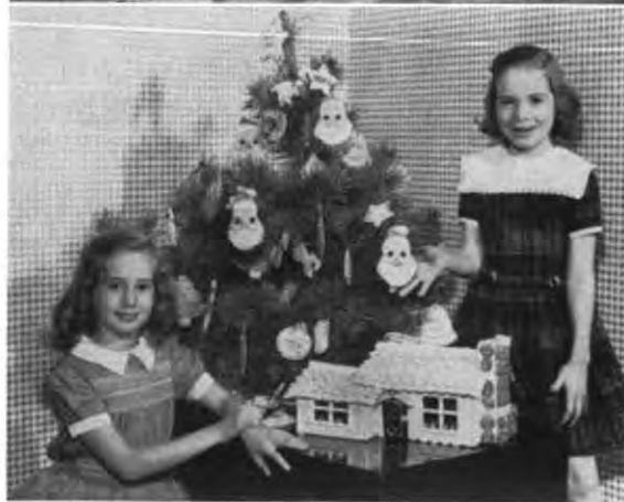
Southwestern Indiana Alumna Club Pi Phi Christmas Party Parade