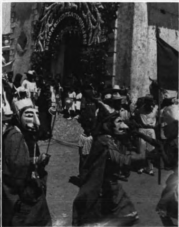
FIESTA IN TAXCO, MEXICO