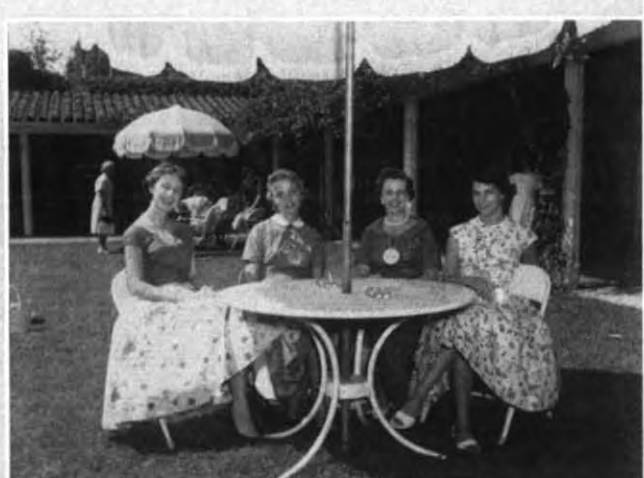
At the reception