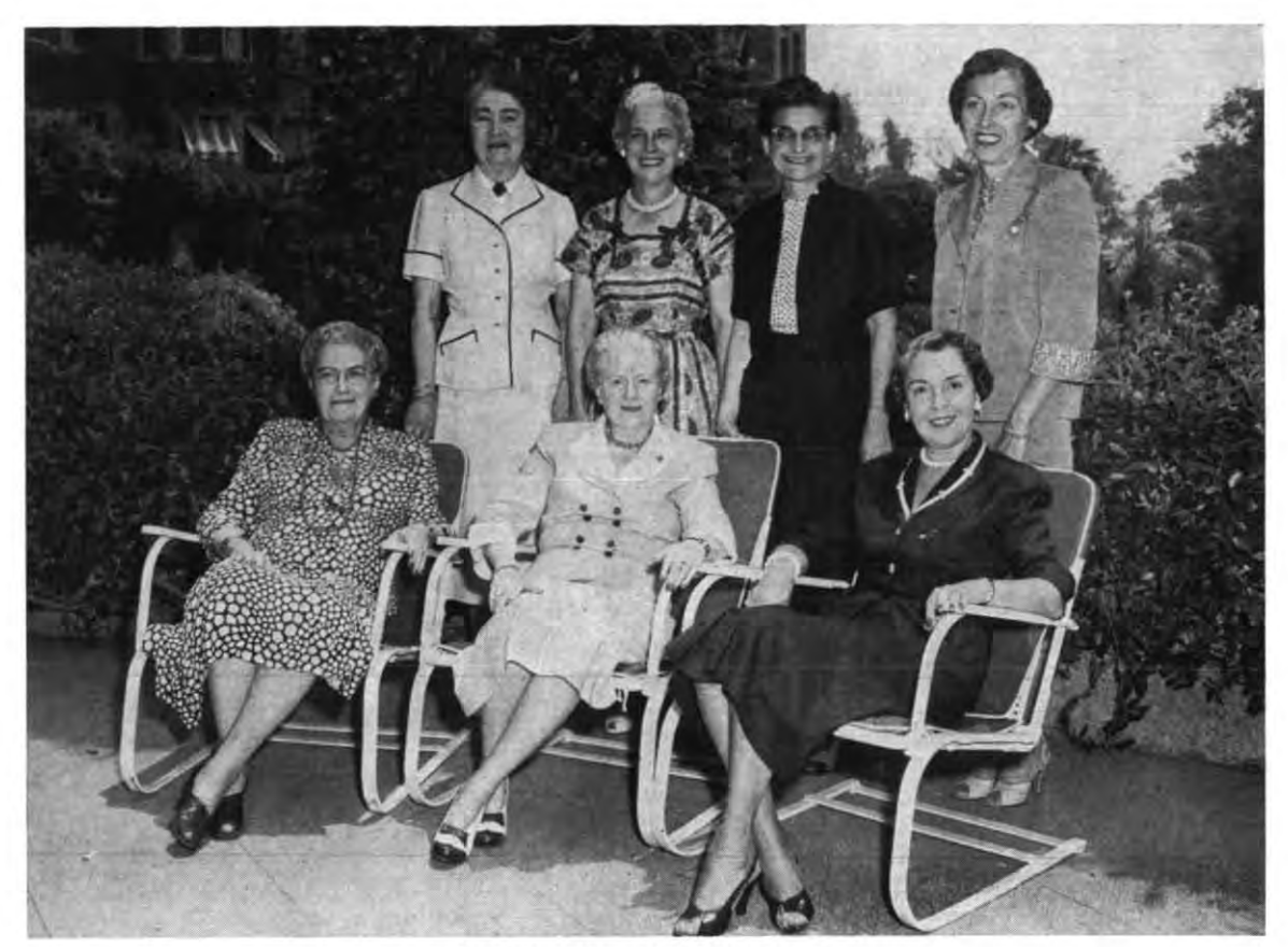
GRAND COUNCIL, CONVENTION 1956