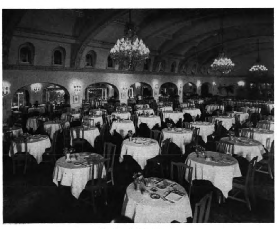
The Crystal Dining Room

We all enjoyed the beautiful scenery from the Picture Bridge and delighted in the superlative cuisine in the fabulous dining room.