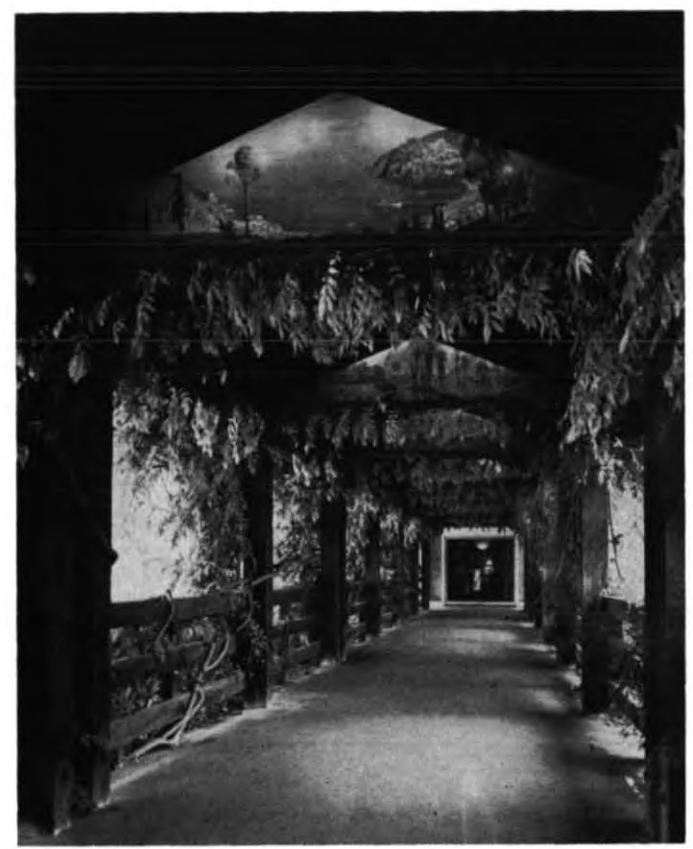
The famous Picture Bridge

We all enjoyed the beautiful scenery from the Picture Bridge and delighted in the superlative cuisine in the fabulous dining room.