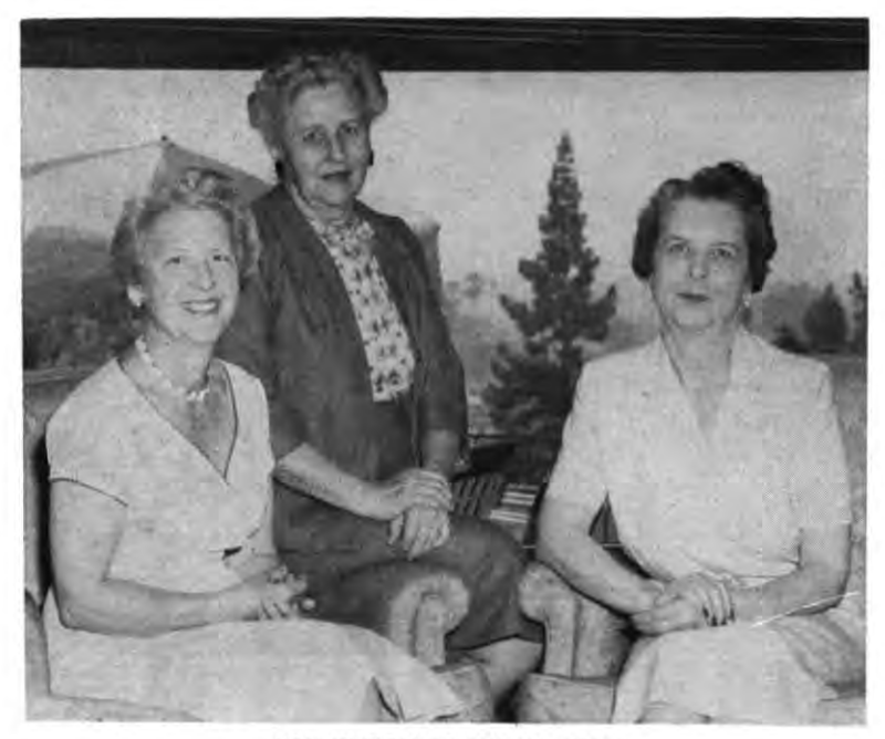
CONVENTION COMMITTEE 1956

From the dignified and deeply impressive memorial service which followed the reading of greetings and the introductions at the opening meeting, to the final flicker of the last candle on the ex-