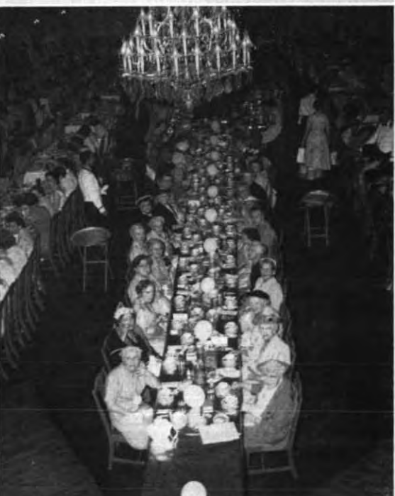
The Golden Arrow Luncheon

Another view of the Luau showing the beautiful background against which it was set.