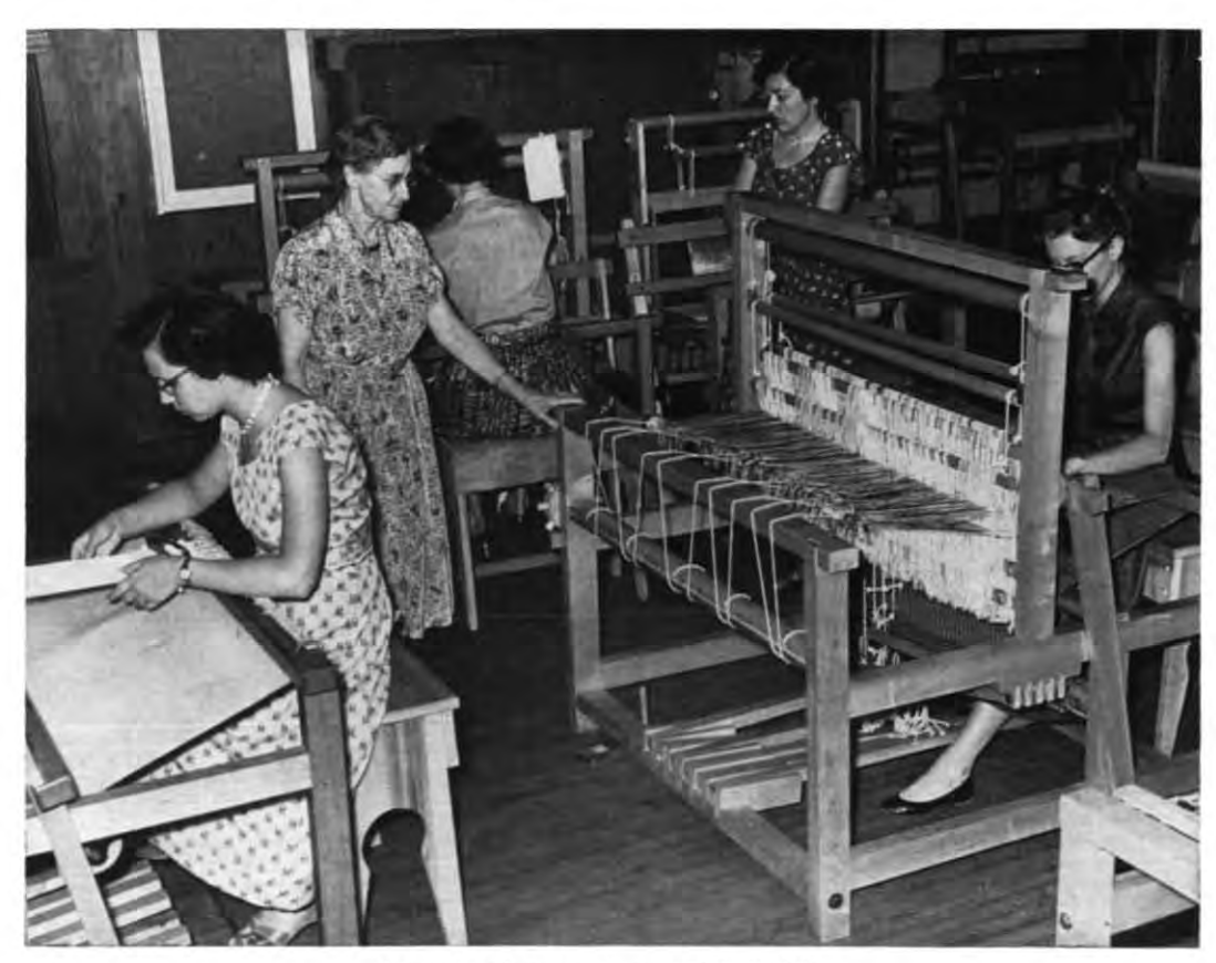
A weaving class at a Summer Craft Workshop