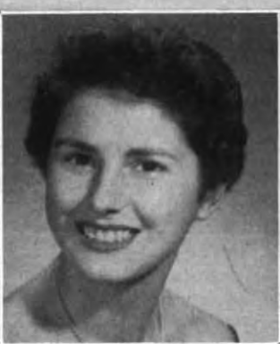
Florence Arabian Connecticut A