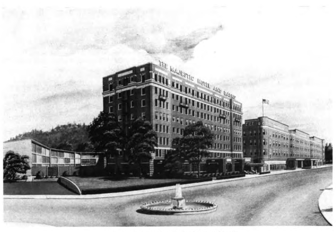
Majestic Hotel, Hot Springs National Park, Arkansas