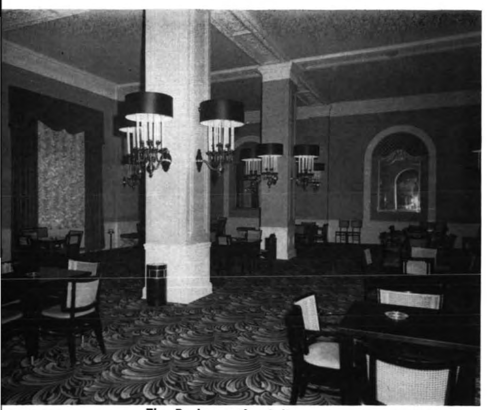
The Parlor at the Arlington