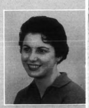
Florence Arabian Connecticut A