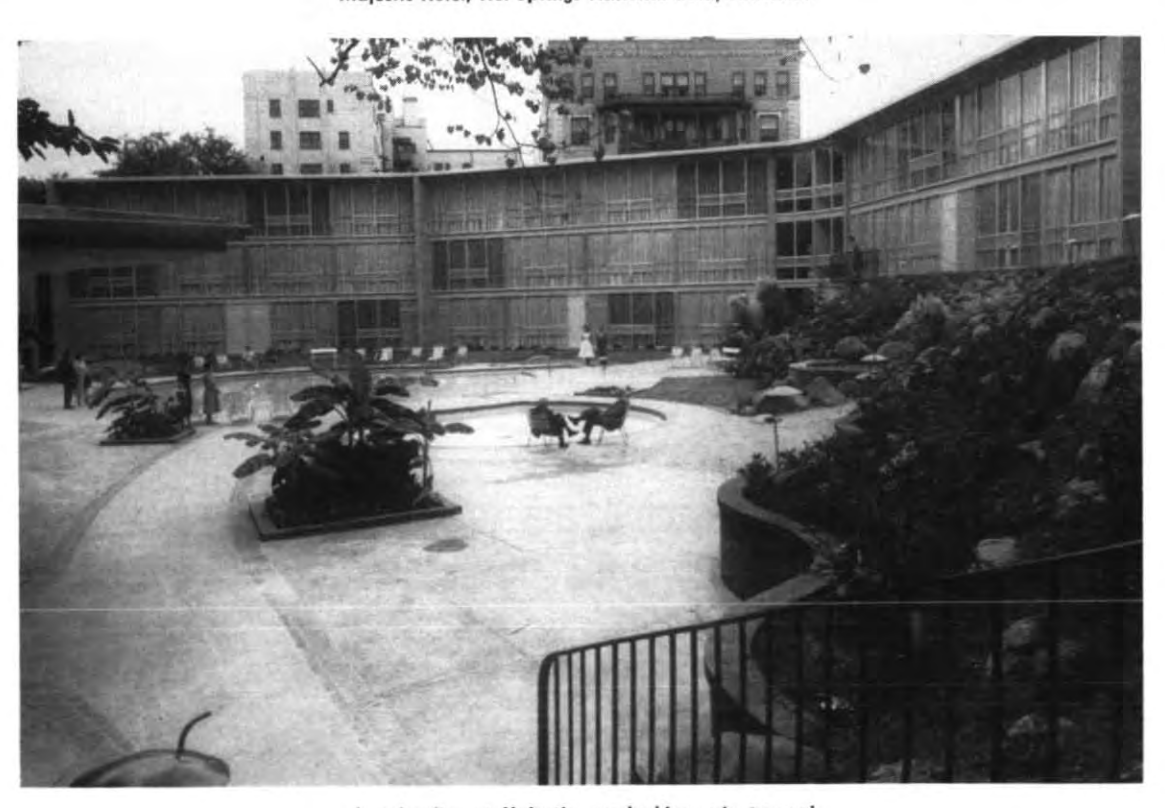
Lanai suites at Majestic, overlooking private pool