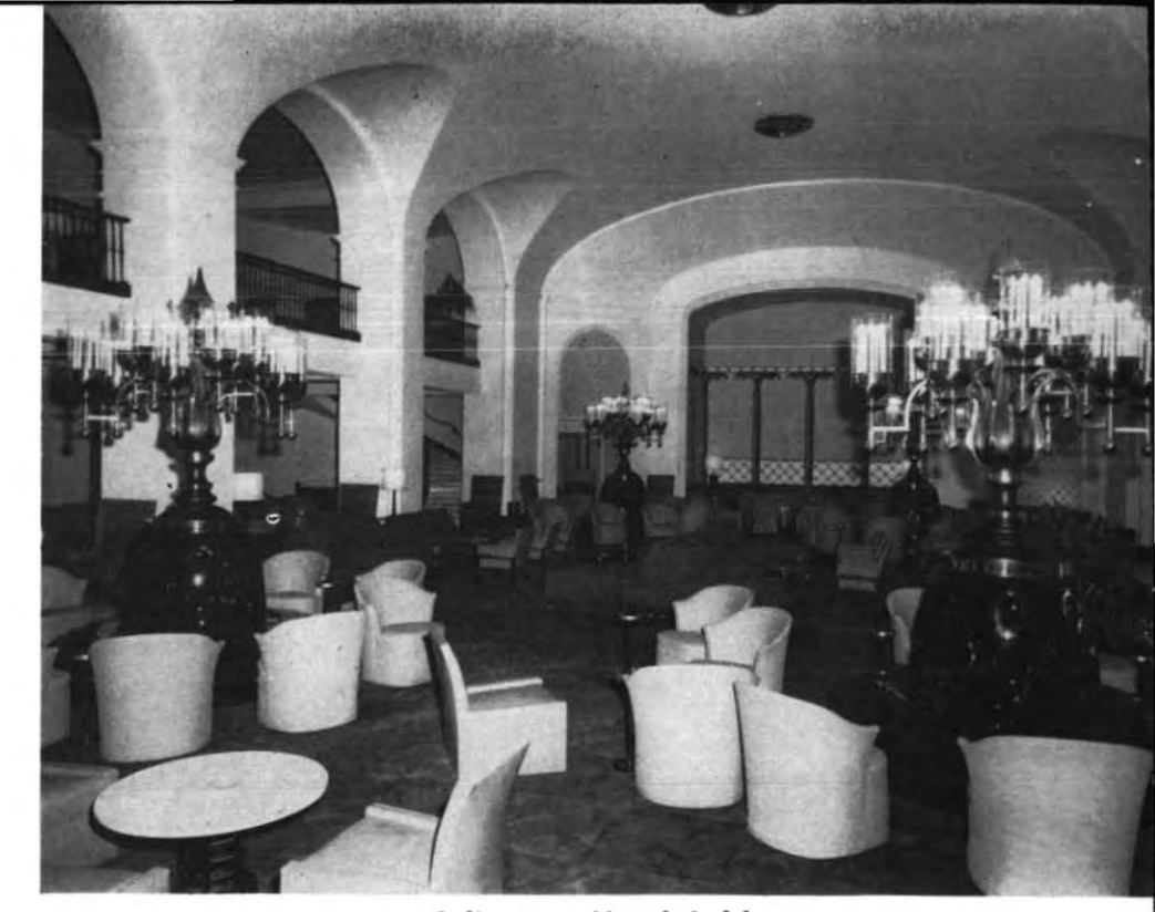
Arlington Hotel Lobby