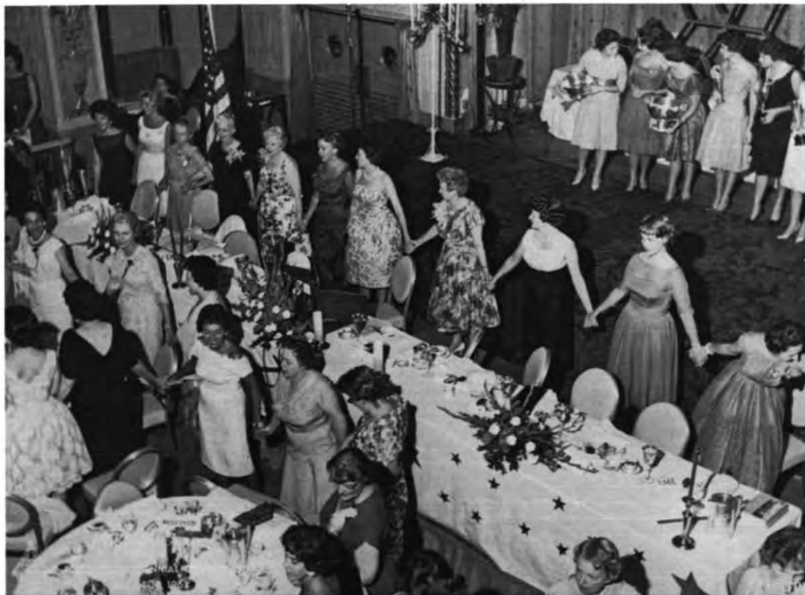
Pi Phis join hands for that final Convention song following the Awards Banquet.

"We are what we think—may God grant us the courage and the strength to think always on those things that are 'true, honest, just, pure, lovely and of good report'—that the vivid hues of virtue and praise may ever be our talismen."