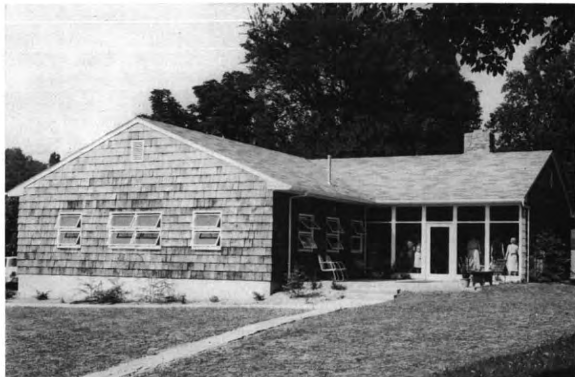
New Weaving Studio

The 1962 Mountaineer (high school annual) was dedicated to Pi Phi with these words: "To the members of Pi Beta Phi Fraternity, whose courage and foresight have, for fifty years, demonstrated the finest attributes of a democratic nation."