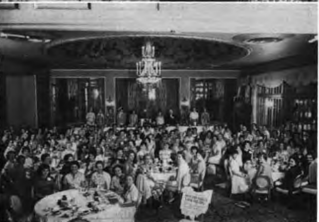
Top—Golden Arrow Pi Phis visit at their luncheon.