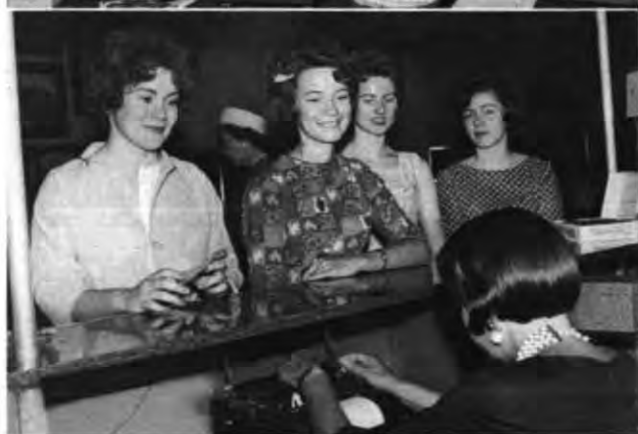
Top—The Old Timer's Luncheon, 1962.