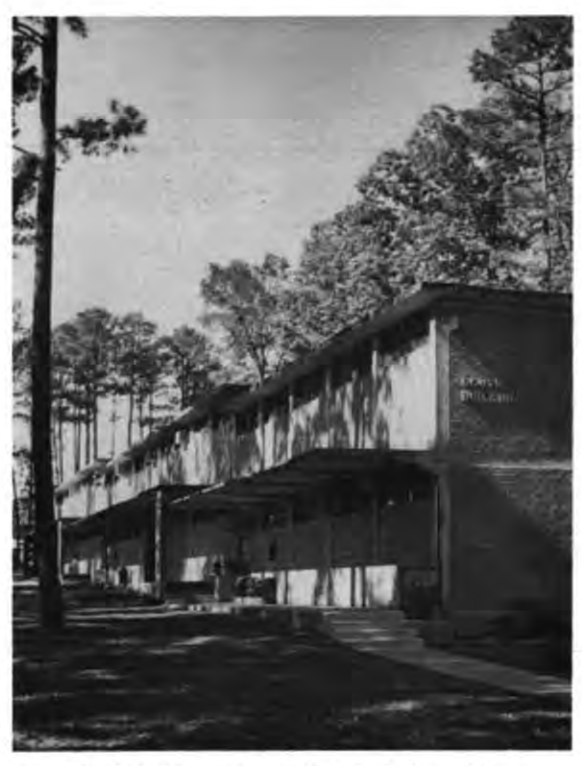
South Building—One of Little Rock University's classroom buildings.