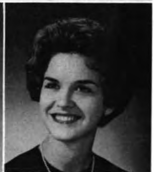
Phi Sigma Kappa Moonlight Girl