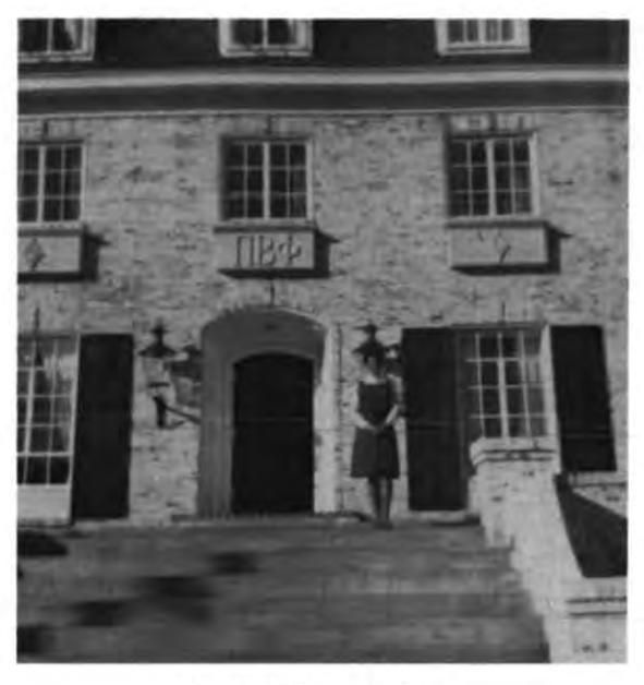
Kansas Alpha's new home.

administration was extremely cooperative about providing living quarters for the displaced Pi Phis.