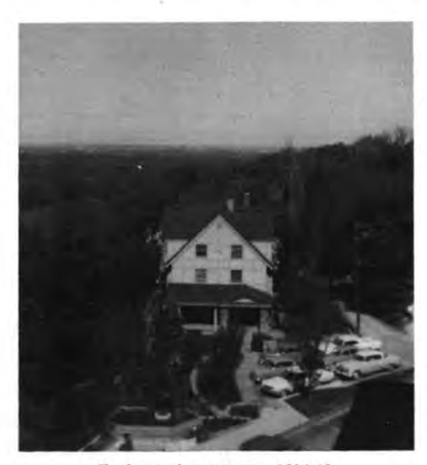
The home of yesteryears-1914-62.

The move brought an end to over a month of confusion for the Kansas Alpha members. Approximately fifty girls had lived in the old house even though it had been partially converted into offices during the summer by its new owner, the University of Kansas Extension Bureau. Most of the furniture had been sold which meant the girls must live out of suitcases, with luckier ones having access to one dresser drawer. The kitchen had been dismantled which meant that for over a month the Pi Phis ate three meals daily at the Student Union. Ten actives lived in two temporary locations, first at Hodder Hall and later at Hashinger Hall. The University