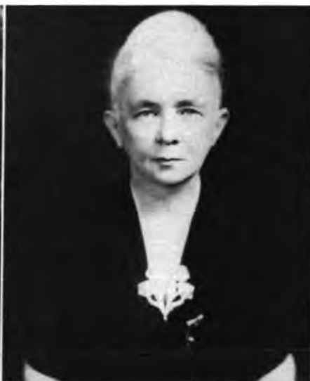
A familiar portrait of a great leader.