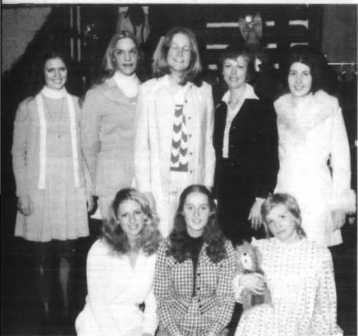
Vermillion alumnae and South Dakota Alpha collegians enjoy a holiday style show and silent auction together.