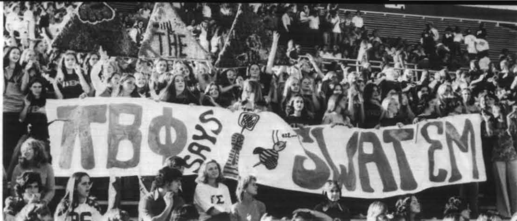
Alabama Gamma pledges made the front page of the Atlanta Journal last October as they held up this sign during an Auburn University pep rally, prior to the game between Auburn and Georgia Tech.