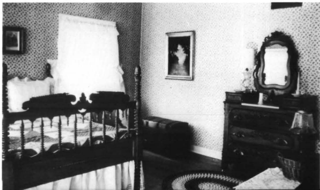
THE Southwest Bedroom

Ada's and Libbie's bedroom has been restored and furnished to be a close reproduction of the way it was when they lived there. Flowered wall paper, ruffled curtains, wash stand, and black heating stove are as nearly like the originals as possible.