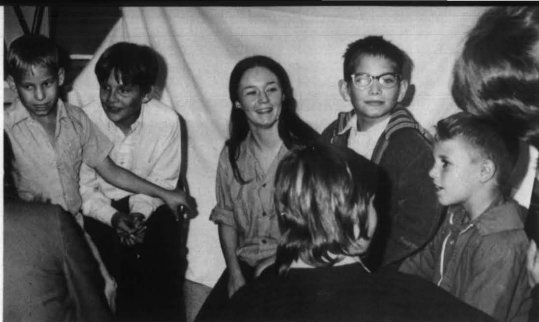
Arkansas Alphas entertain underprivileged children at a Halloween party.