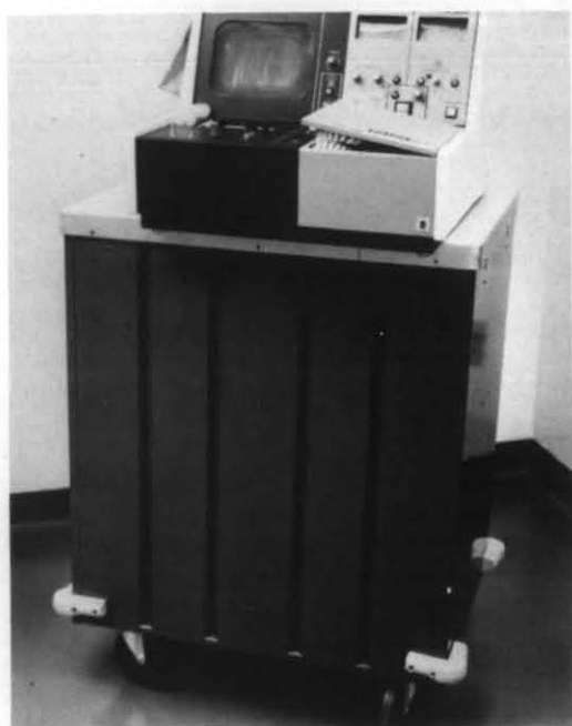
"Code Blue Cart" was purchased with funds received by Kansas Alpha's centennial gift committee.

It was decided to have a permanent gift on campus and arrangements have been made for