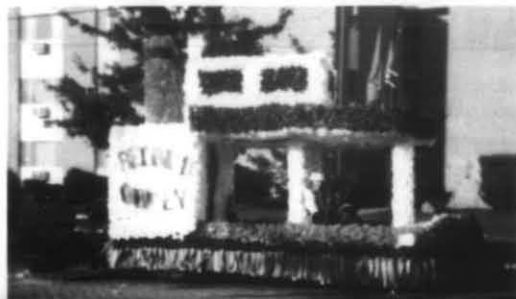
Illinois Eta's Homecoming float with ATOs.