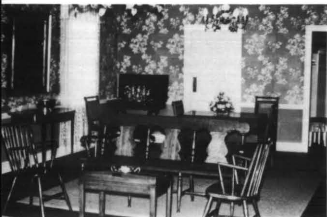
The Music Room