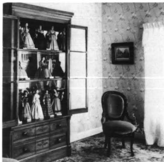
Our Founders In Wax

The room used the most is the Music Room —sometimes called the Dining Room. Three rooms were put together to make this lovely large room across the back of the house. The powder room is to the right and the swinging door to the left leads to the kitchen. Between the doors now hangs an enclosed cabinet for the antique coin silver spoon collection.