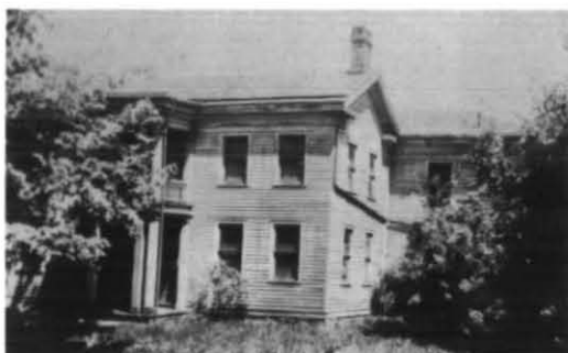
Holt House looked like this at the time it was purchased by the Fraternity. This picture hangs on the wall in the historical room next to the cabinet of the Founders.