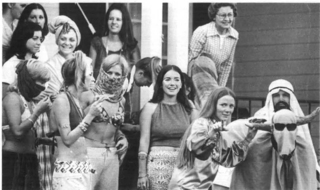
Genies and sheiks instead of Pi Phis? It looked that way when Illinois Eta held their latest scholarship banquet. Those sisters who made the Dean's List were the genies and the rest came dressed as sheiks. The banquet honors those who have made the Dean's List and those who have contributed the most toward high scholarship for the house. An award is given also to the girl who has improved her grades the most from the previous semester.