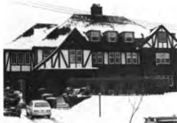
Iowa Zeta, University of Iowa, Iowa City. Founded 1882. House is seven blocks from campus and is a Tudor structure over fifty years old. Houses forty-nine. Kitchen and dining room are on lower level overlooking patio and wooden terrace. Most girls sleep in "open air" dorms.

Nebraska Beta, University of Nebraska, Lincoln. Founded 1895. Modified Georgian style house was built in 1926. Located on "sorority row," two blocks from campus. A recent addition of dining room, kitchen, and bedrooms allows comfortable housing for fifty-six.