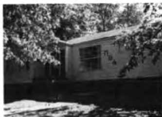
Arkansas Beta, University of Arkansas at Little Rock. Founded 1963. Chapter lodge has den, living room, large chapter room, kitchen, bathroom, and office. No living facilities, but used extensively for meeting friends, and just relaxing.