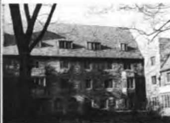
Illinois Epsilon, Northwestern University, Evanston. Founded 1894. Chapter house was built in 1927 and stands as part of the ivy covered quadrangle of sororities and fraternities. Houses forty-five.