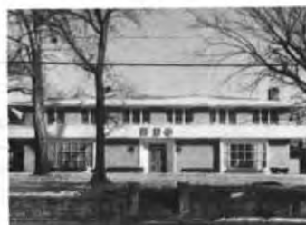
Arkansas Alpha, University of Arkansas, Fayetteville. Founded 1909. Chapter house includes formal and informal living rooms.