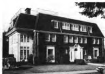
Oregon Alpha, University of Oregon, Eugene. Founded 1915. House has capacity of fifty-six. Three sleeping porches. Finished basement is used as a TV room, along with laundry and storage rooms.

Oregon Beta, Oregon State University, Corvallis. Chartered 1917. Built in a square, the house holds sixty-three. A courtyard in the center of the square features a fountain. House is located at the corner of a park block and faces the park. One of largest living facilities on campus.