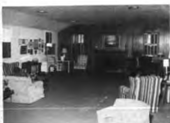
Missouri Gamma, Drury College, Springfield. Chartered 1914. There are five Panhellenic Groups on the Drury campus. All are housed in suites.