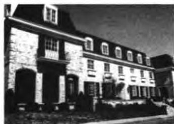
Kansas Alpha, University of Kansas, Lawrence. Founded 1873. One of twelve sororities on campus and first to be established there. Cooky-Shines are special here since this is where they originated. Sophomores, juniors, and seniors live in the house.