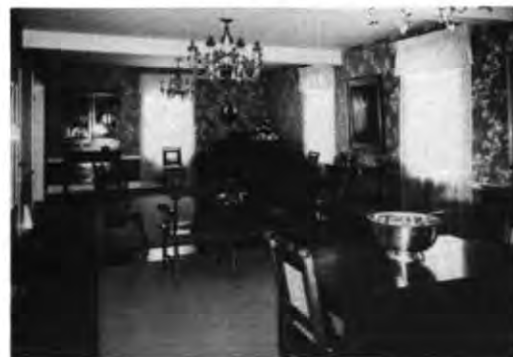
The Music Room

In 1971-1972, the replacement of the entire roof was necessary and a new humidifier was purchased for the furnace. A special recognition for Holt House was having its picture on the Monmouth city car stickers. A special purchase of two window air conditioners for the downstairs were also purchased. Because of a generous donation of green stamp books, a new refrigerator-freezer replaced the old worn out refrigerator.