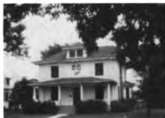
Iowa Alpha, Iowa Wesleyan, Mount Pleasant. Founded 1868. A ten-room lodge near the campus is used for meetings, ceremonies, and parties, as well as for individual studying or relaxing. Women are required to live in dormitories. First off-campus house to be obtained by a sorority at Wesleyan.