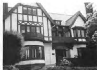
California Beta, University of California, Berkeley. Founded 1900. Located one block south of campus, the chapter house holds sixty women. Chapter occupied two smaller houses before moving to the current one which was once the home of the mayor of Berkeley.