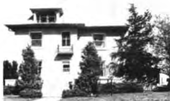
Iowa Beta, Simpson College, Indianola. Founded 1874. Chapter is one of four on campus of this four-year liberal arts college.

Iowa Gamma, Iowa State University, Ames. Founded 1877. A three-story red brick house, it is the only sorority house on fraternity row. It accommodates sixty girls with two floors of cold-air dorm sleeping. A newly remodeled rec room and the old chapter room, both in the basement, are reserved for studying.