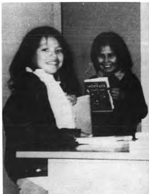
Eskimo children look forward to reading the books they find in the Yukon Library.

As voted by the Canadian delegates to the 1975 Convention, letters were written to notify the nine universities in Canada holding Canadian Loan Fund money for social work students that those funds would be recalled by May 1, 1977. Canadian delegates to the 1977 Convention voted on a new project for the returned funds.