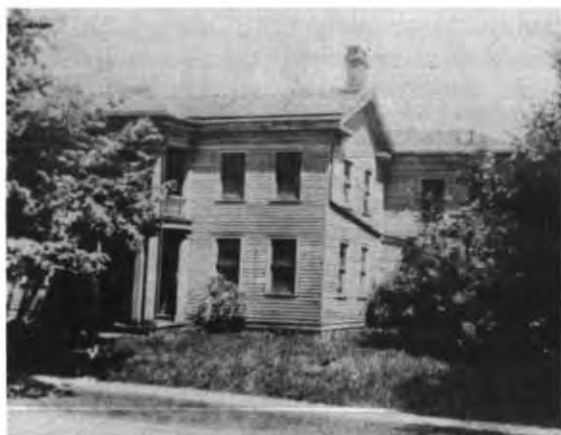
Holt House at the time of its purchase by the Fraternity in 1939.

With the annual club and chapter donations, as well as assistance from Fraternity funds, carpeting was replaced on the stairs and in the entry; painting, wallpapering, chair refinishing and recovering were accomplished by the committee in 1975-1976. The slide presentation was updated and made available for club and chapter programs, also.