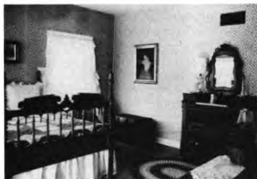
Bedroom of Ada Bruen and Libbie Brook