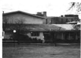
Oregon Gamma, Willamette University, Salem. Founded 1944. Present chapter house was built in 1963 and has capacity of forty-six girls. Basement includes a functional library. Sleeping porches on upper two levels. Built on university-owned property.

Oregon Delta, Portland State University, Portland. Founded 1960. Uses a lodge.