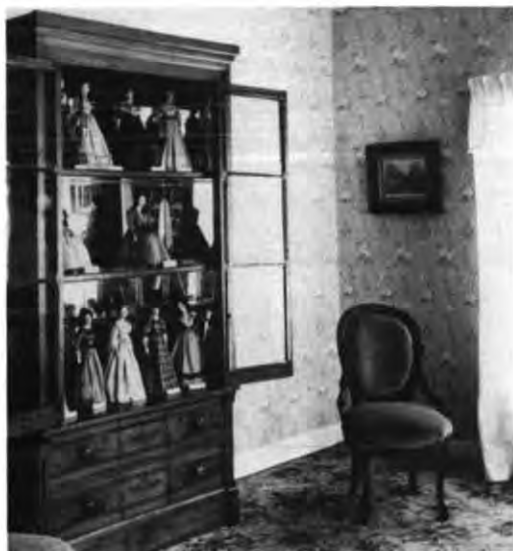
The Founders in Wax