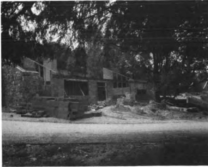
From the first rumblings of bulldozers, cement mixers, hammers, and saws, in 1969 to. . .

. . . the realization of a dream when the Emma Harper Turner Building was dedicated in 1970—this is Arrowmont.