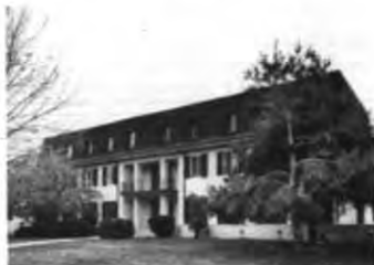
Kansas Beta, Kansas State University, Manhattan. Founded 1915. Oldest sorority on campus, the chapter is now in its third house, with a capacity of 60.