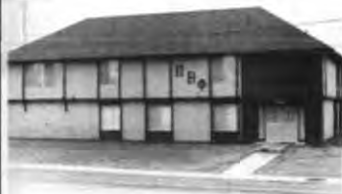
Illinois Iota, Illinois State University, Normal. Founded 1974. The two-year-old chapter house accommodates thirty-six and has dormitory style living quarters. It is located two blocks west of campus. Formal living room, paneled dining room, house director's suite, chapter president's room and kitchen are on main floor.