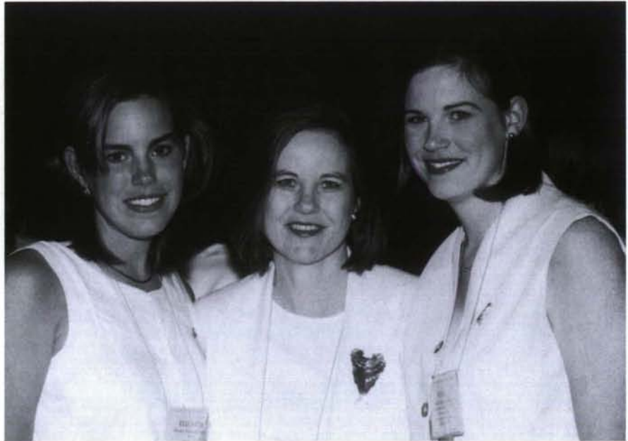
Legacies at the 1995 Convention in Palm Desert, California.

It is imperative that our chapters know the Pi Phi legacies going through rush. Complete the form below and send it to the chapter's CMC.