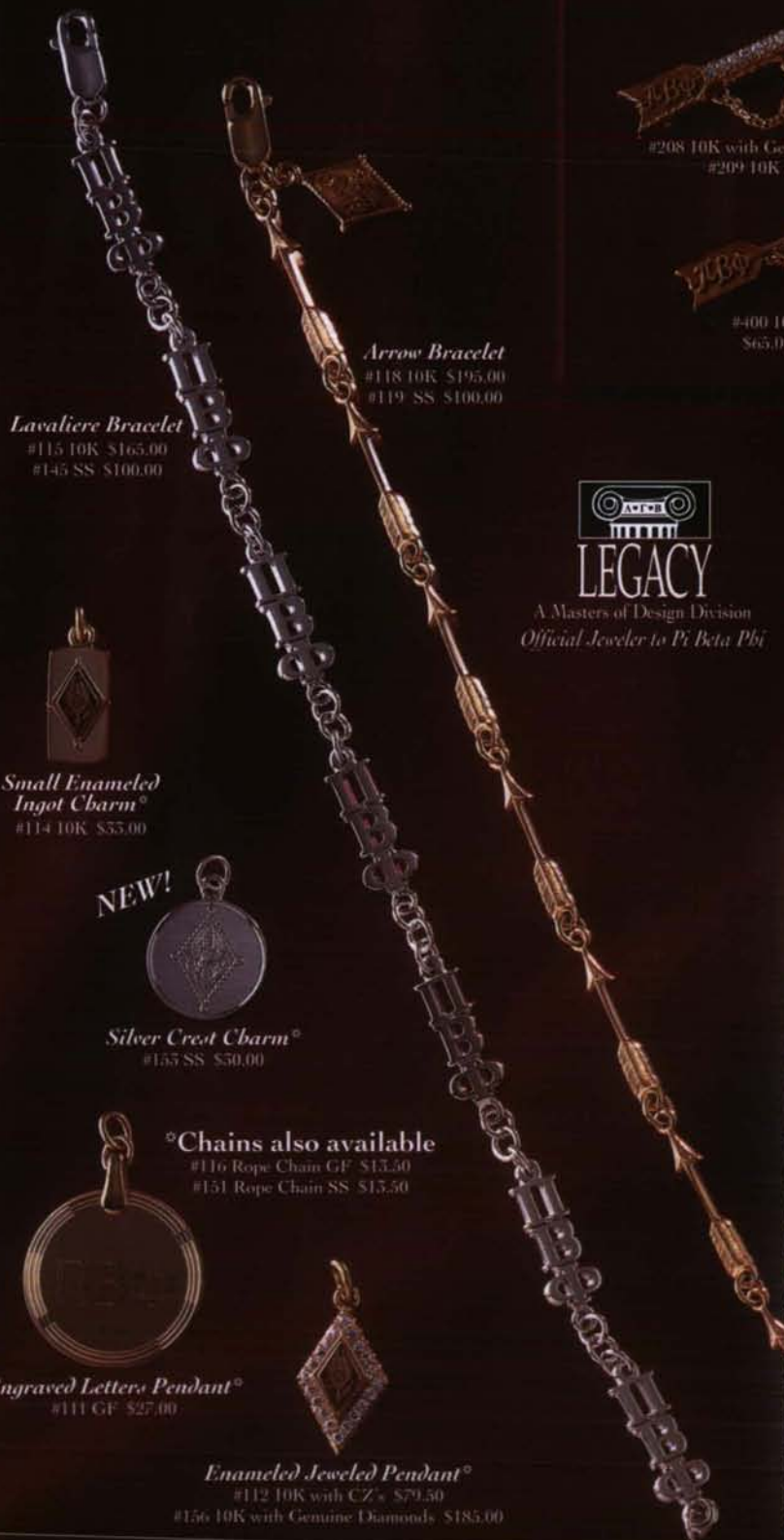
Lavaliere Bracelet #115 10K $165.00 #145 SS $100.00