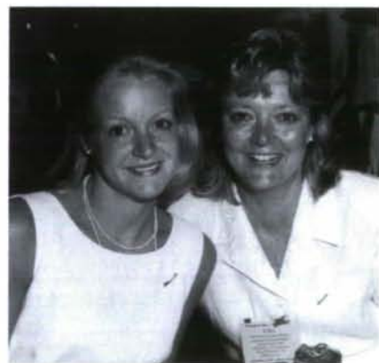
Legacies at the 1997 Convention in Atlanta, Georgia.

It is the rushee's obligation to enter rush with an open mind, to look at all Greek groups where she may have an affinity and to select the group that is best for her.