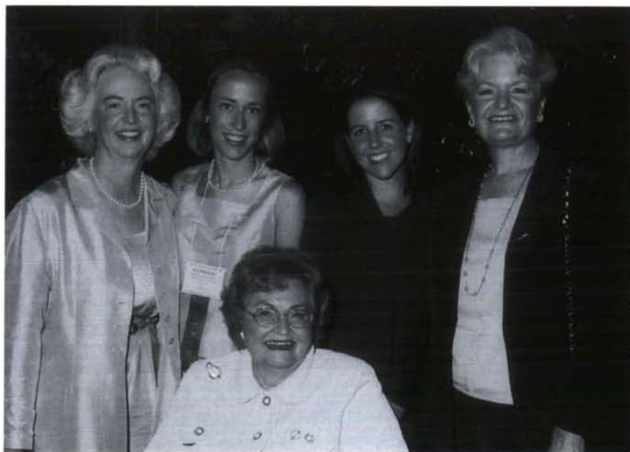
Legacies at the 1999 Convention in Houston, Texas.