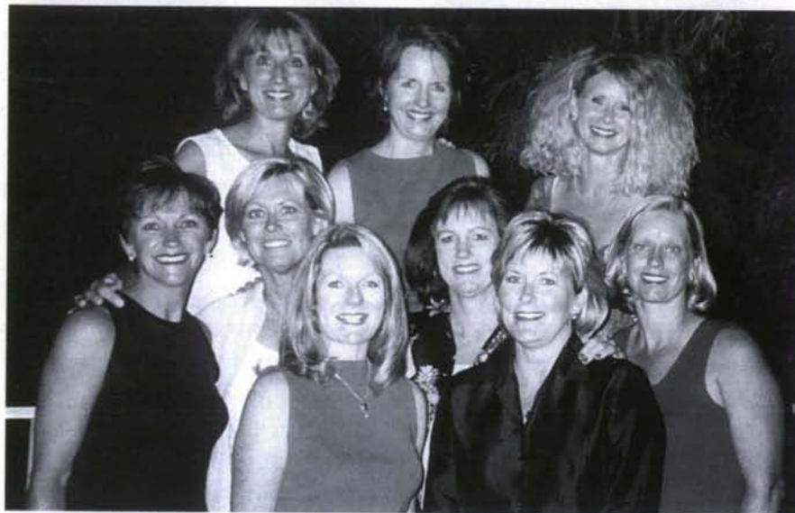
Last September, several ARIZONA ALPHAS reunited in Tucson, Arizona and stayed at the Ventana Canyon Resort. The group had a great time sharing memories and new stories.