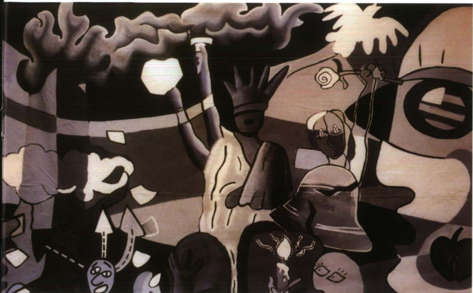
"The Eleventh Day"