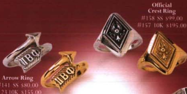
Arrow Ring #141 SS $80.00 #123 10K $155.00