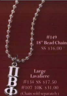
Large Lavalier #134 SS $17.50 #107 10K $31.00 (Chain sold separately)