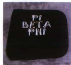
CD Holder 01PP12 $18.95