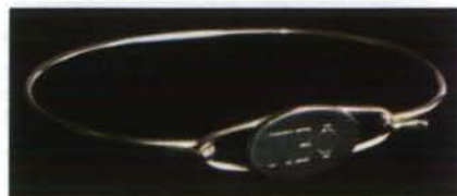
Sterling Silver Oval Hook Bracelet 01PP21 $32.95