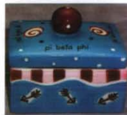
Pin Box 01PP8 $14.95

To order call (800) 453-5344 or visit www.pibetaphi.org .