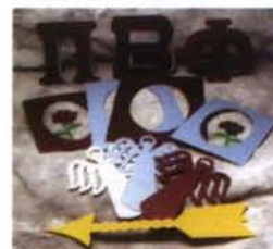
Scrapbook Kit 01PP18 $14.95