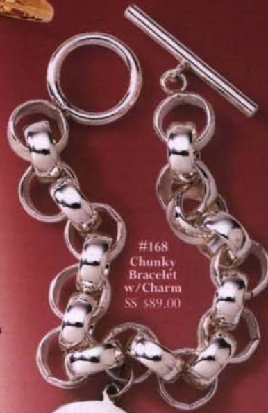
#168 Chunky Bracelet w/Charm SS $89.00

Many of these items shown are in stock, but we do suggest ordering early for gift items—especially our custom-made rings. Most jewelry available in yellow gold, white gold and sterling silver; please inquire.