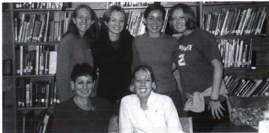
Kentucky Betas made reading calendars for local elementary school children so they could keep track of their reading. They also participated in a local middle school's book fair.