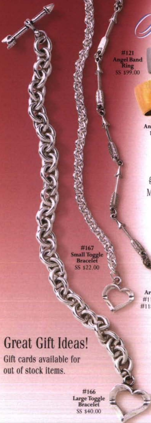
#166 Large Toggle Bracelet SS $40.00

Gift cards available for out of stock items.