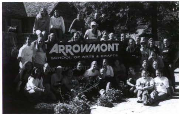
Florida Epsilons from the University of Central Florida participated in a fall cleaning at Arrowmont as part of a trip to Tennessee that also included visits to Pi Beta Phi Elementary School and the Tennessee Gamma Chapter at the University of Tennessee.

The success of the ArtReach program can be measured by the smiling faces of the children when they leave Arrowmont after a day of new experiences, learning and fun — and by the most frequently asked question at the end of the day, “when do we get to come back to Arrowmont?”