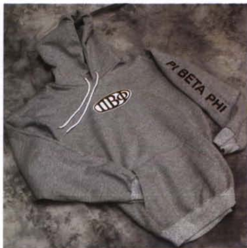
ΠΒΦ Hooded Sweatshirt 001PPHD3 $36.95 Sizes Available — M, L, XL