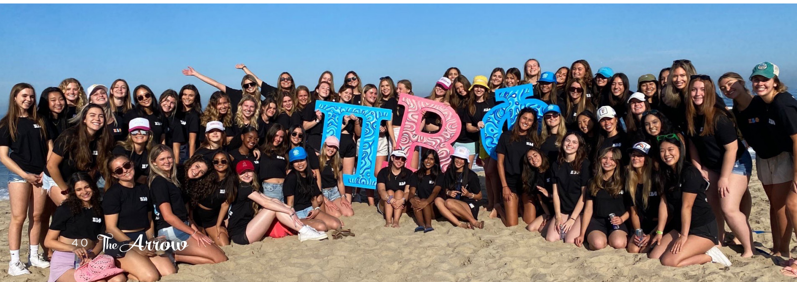
Below: California Kappa members at their 2022 Arrowspike event on Pacific Beach.