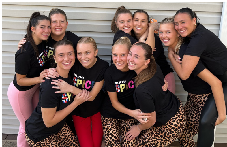
Below: Ontario Beta members celebrating their Mamma Mia themed recruitment.