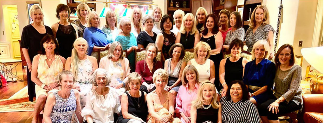
Above: Arizona Beta alumnae gathered for their Golden Arrow reunion celebration.