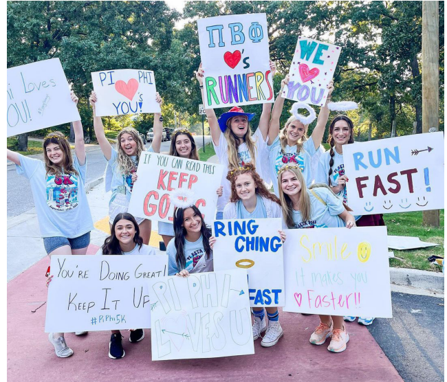
Above: Arkansas Alpha members cheering on runners during the chapter's annual Pi Beta Phi 5k.

For the first time in two years, the California Kappa Chapter held its favorite in-person philanthropy event, Arrowspike. With involvement from the surrounding communities and dozens of companies sponsoring the event, California Kappa raised $14,500 to benefit