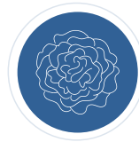
flower Wine Carnation