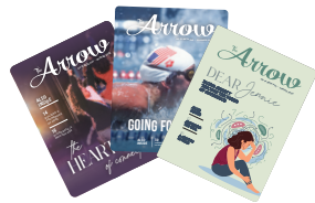
magazine The Arrow