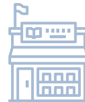
MILITARY FAMILY SUPPORT PROGRAMS