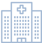
SHELTERS & CLINICS