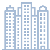
AND MANY MORE!