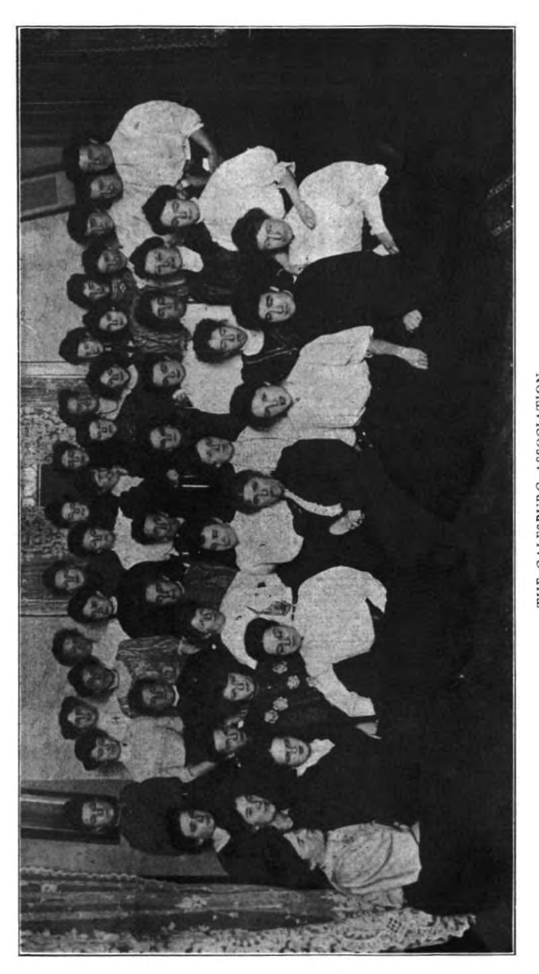
THE GALESBURG ASSOCIATION