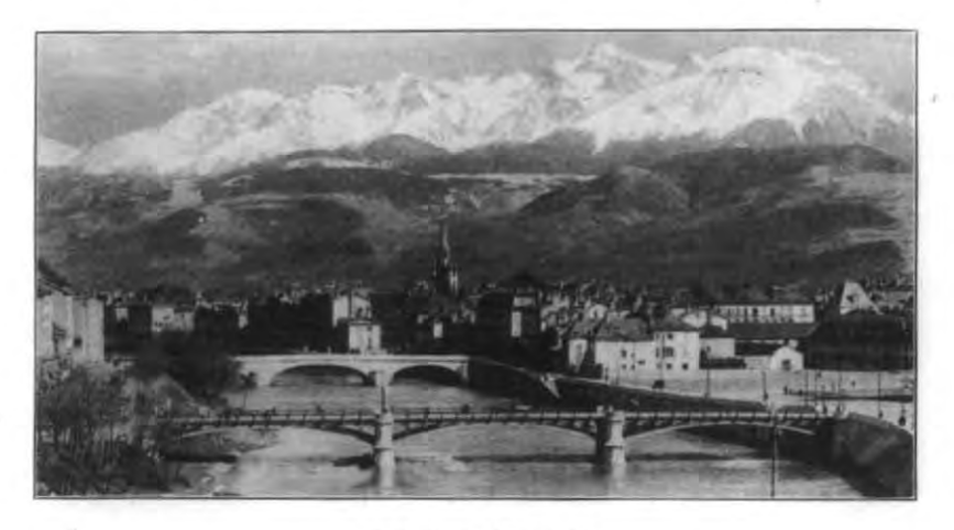
A VIEW OF GRENOBLE

In addition to these general lectures on phonetics, there are special classes organized for practice in pronunciation. For these a small additional fee is charged. Having paid this, the student goes to the Institute of Phonetics and, after a brief examination, is assigned to a class which is provided with a special teacher. The class consists of not more than six persons who meet for lessons three times a week. The teacher assigns to each student some definite selection to prepare in a book specially arranged for his work by Professor