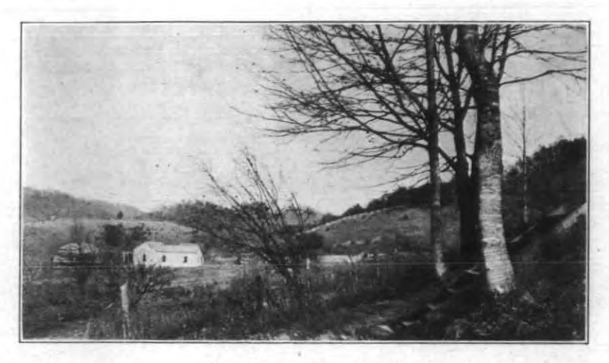
THE ANDREW OGLE HOUSE

On either side we saw the havoc wrought by "the mountain wind" which blew with such terrific violence last night (everywhere trees