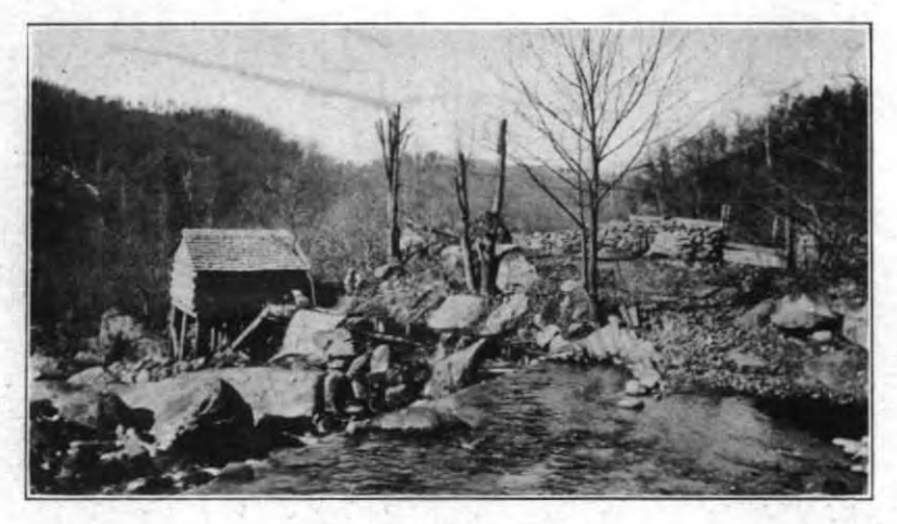
A TYPICAL WAYSIDE MILL

sandwich they insisted that I should have some dinner with them; and the invariable remark on leaving is "Better spend the night with us." To my great relief the sick boy was better and well on the road to recovery. I also discovered that he was one of a number of boys I had met while taking care of a desperately ill lad, and I shall always maintain that they are among the finest lads I have ever met. He suggested a shorter way home—just four miles of more level road, so we arrived home as school was being let out, in time to meet one of the high school girls with a noticeably swollen jaw. Very reluctantly she came back with me, after a solemn promise not to hurt.