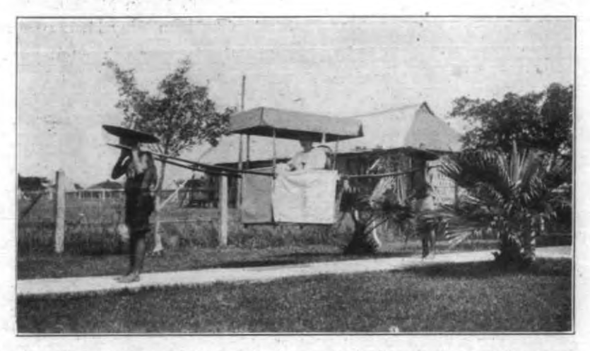
ON MY WAY TO SUNDAY SCHOOL AND CHURCH ON SUNDAY MORNING

civilization without Christianity, the peace of the entire world will be endangered. What benefit will be derived from an educated nation without the sound guiding principles that only Christianity can instill? Some might call attention to the great number of good people in the United States who do not pretend to be Christians. Nevertheless the moral standard by which they live and the laws by which they are governed are based on Christianity. If Christianity had never been preached in our great America, our nation would still be in the condition of China with her robbers, plagues, floods, uprisings and immorality.