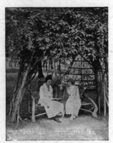
VINE CLAD ARBOR

During Convention Pi Phi will have exclusive use of The Inn, which will accommodate about 400 guests. However, any overflow