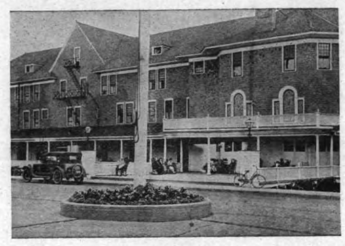
THE INN West Main Entrance

Buy your railroad tickets from your home or your starting point direct to Charlevoix, Mich., arriving there on the Pere Marquette Railroad, via Grand Rapids, Mich., Detroit, Mich., Toledo, Ohio, or Chicago. These will all be meeting places for Pi Phis, and starting