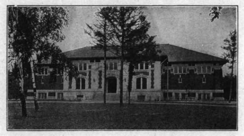
MEMORIAL GYMNASIUM, PURDUE UNIVERSITY