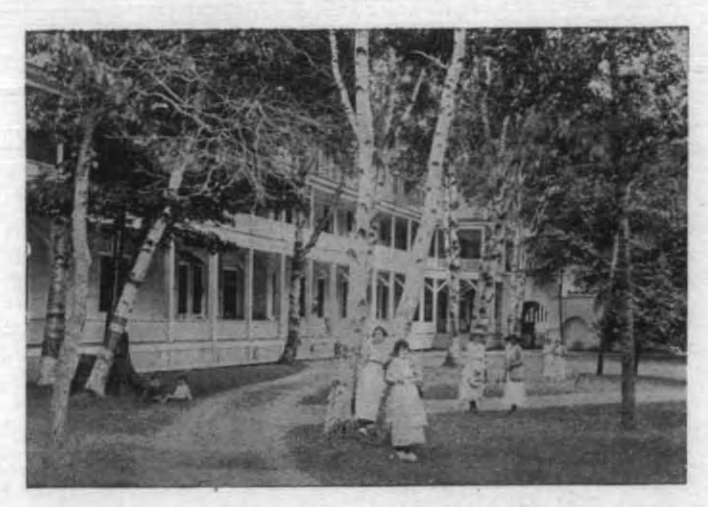
SECTION OF THE INN GROUND

It is very necessary that you fill out the enclosed registration blank, and mail to the Convention Guide when making reservations with Mr. Creamer, as the Guide has charge of room assignments. If you desire to be en suite with or near friends who have made previous reservations, give necessary details of information and everything possible will be done to accommodate you. People making the earliest reservations will, of course, secure the most desirable rooms.