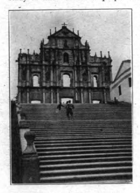
The ruins of the old cathedral at Macau which inspired Sir John Bowring, governor of Hong Kong, to write the famous hymn, "In the Cross of Christ I Glory." Notice the cross at the top that still towers o'er the wrecks of time.

How limited is the Westerner's knowledge of the activity of the oriental mind in its process of reasoning! Nevertheless a continual study of these wonderful people and of their ways, never ceases to