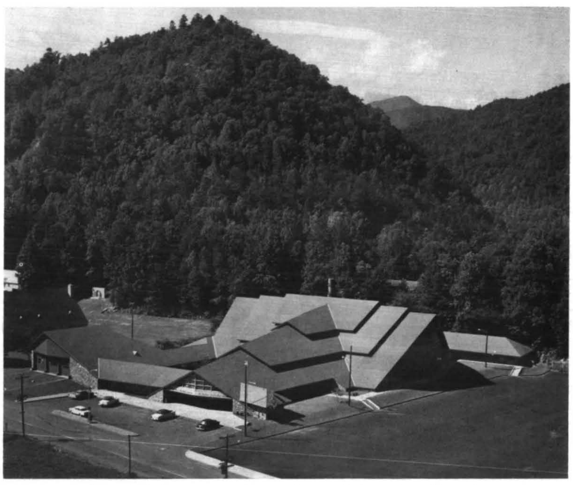
Gatlinburg Civic Auditorium, where 45th Biennial Convention business sessions will be conducted.