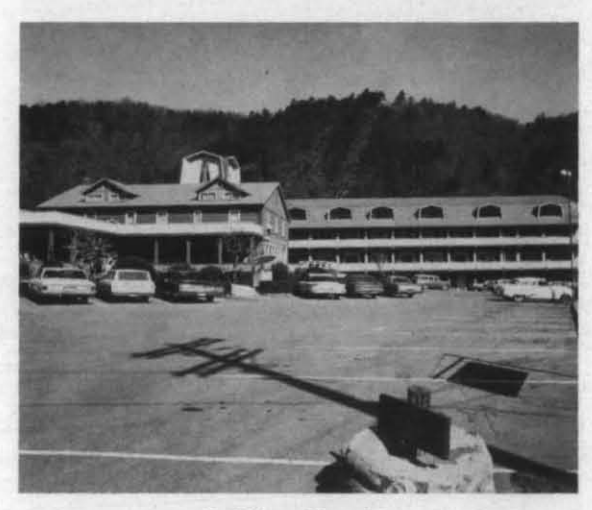
Gatlinburg Motor Inn