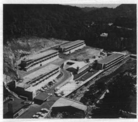
River Terrace Motel