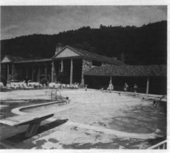
Riverside Motor Lodge