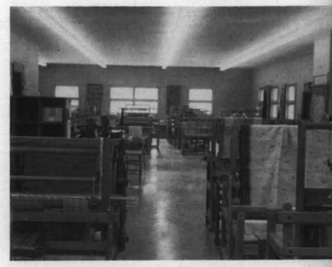
A long look at the Weaving Studio.

"Occupational Therapy is a many-faceted profession employing a variety of physical and mental skills. One of the most important skills essential in the training of all occupational therapists is the knowledge of certain art and craft activities and of their application to the rehabilitation of the physically or mentally handicapped. While learning the basic techniques of the handicrafts the student therapist is taught the principles of design, how to modify designs, the use of color and various materials within a craft, and quality in workmanship.