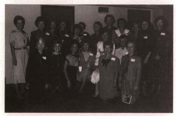
Oklahoma Alpha initiates of 1955 were recognized as the pledge class having the most members registered for the celebration (20).

After almost a year of planning, Oklahoma Alpha Angels are proud of the warmth and smoothness with which the 75th anniversary celebration was accomplished, and of the grand tribute to their chapter.