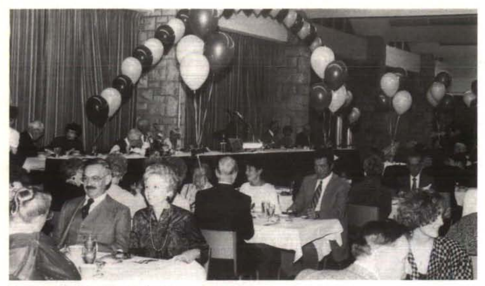
Wyoming Alpha celebrates its 75th anniversary.