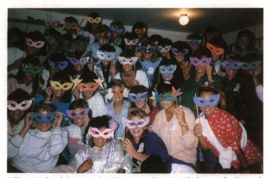
California Epsilon pledges await their Alum-Mums, after making duplicate masks. One mask was randomly picked by each Alum-Mum and the other was kept by the pledge. Then it was just a case of matching masks!