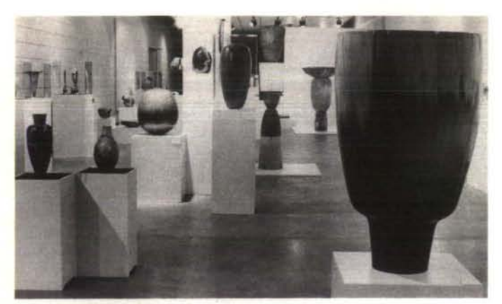
Arrowment's Gallery during the exhibition of "Woodturning: Vision and Concept."