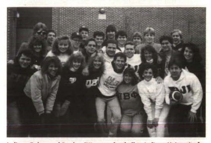
Indiana Deltas and Purdue Fijis ran a football to Indiana University for the Purdue-IU football game. The 100 mile run came known as the Love Run and raised over $3,000 for the American Leukemia Society.