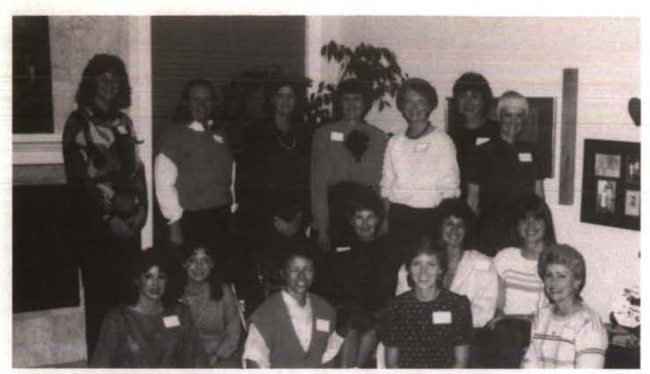
Houston's new alumnae club.