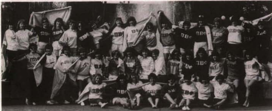
Oregon Gammas won second place in a campus-wide contest at Willamette to see which living organization could come up with the most creative group photo for the college yearbook. These pictures were taken in front of the fountain on state capital grounds.