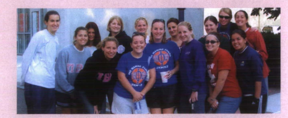
Pennsylvania Thetas participated in a city-wide clean-up in Chester, Pennsylvania.